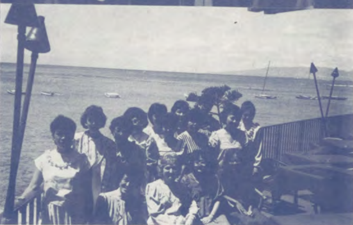
Below: More "Super Island Secretaries" from Honolulu Tower, Flight Standards District Office and Honolulu Center.