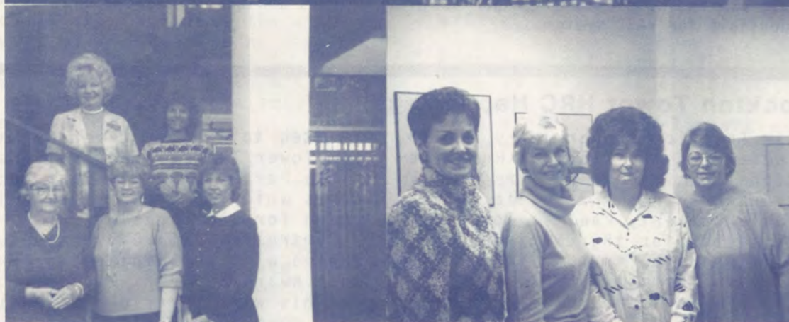
Top : "Super" secretaries from Las Vegas Tower, Flight Standards and Airway Facilities Sector Offices.