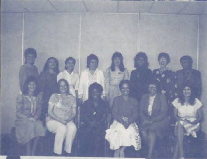
Middle: Oakland Bay area "Super Secretaries" from Oakland Tower, Flight Service Station and Center; Hayward Tower; San Jose Flight Standards District Office; Bay TRACON; Monterey Tower; San Francisco Flight Standards District Office; and San Jose and Reid-Hillview Towers.