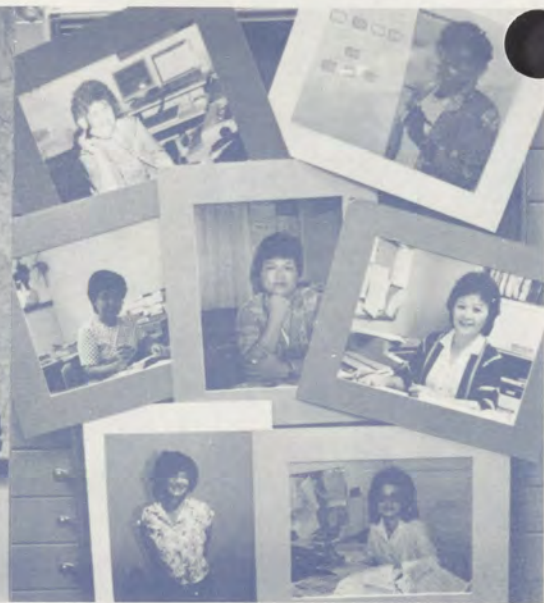
Top left: "Super Secretaries" from Fresno Flight Service Station, Tower and Flight Standards District Office.