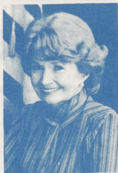
Margaret M. Heckler Margaret M. Heckler Secretary of Health and Human Services 1985 Chairman, Interagency Savings Bonds Campaign