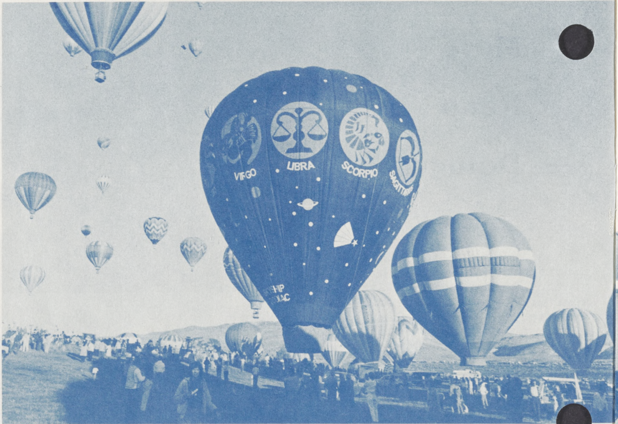
The Great Reno Balloon Race - 1984.