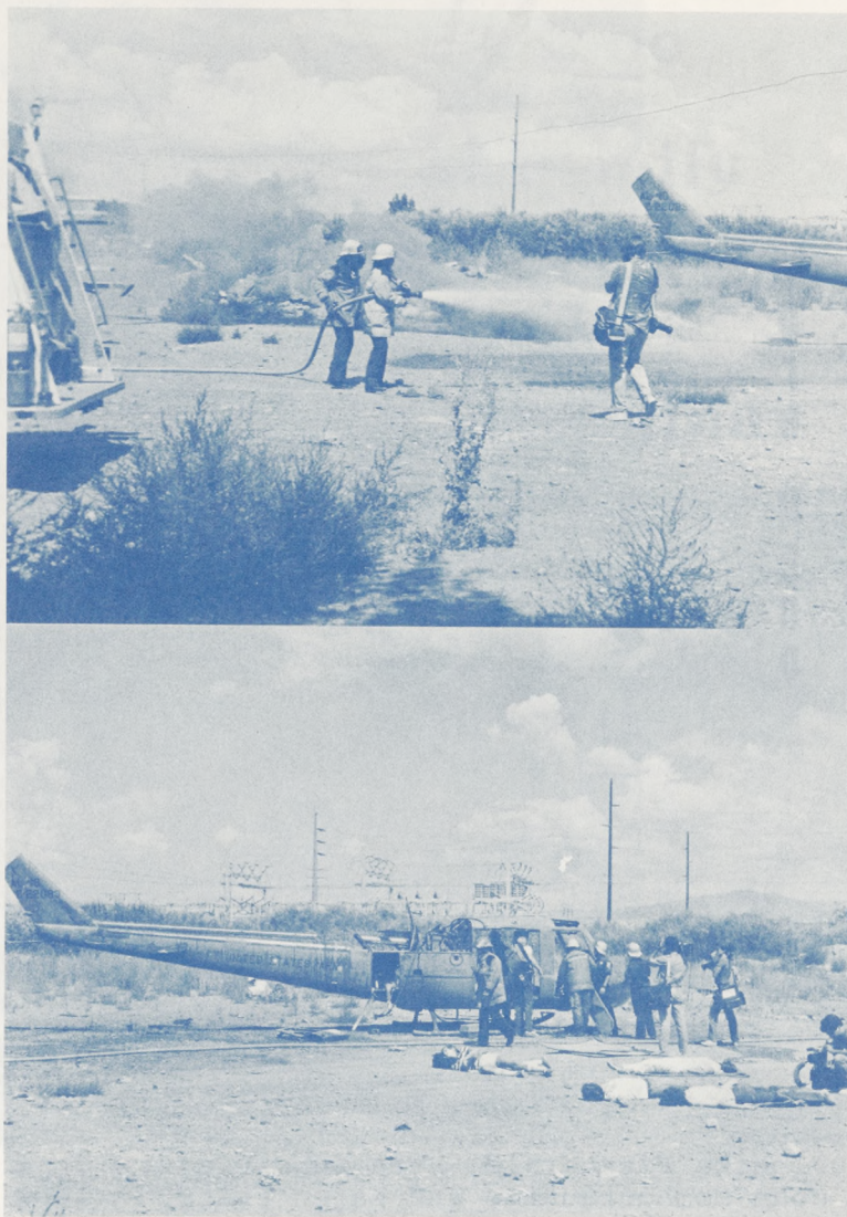
The third annual Airport Safety Seminar, Reno, Simulated Off Airport/Aircraft Crash - 1984.