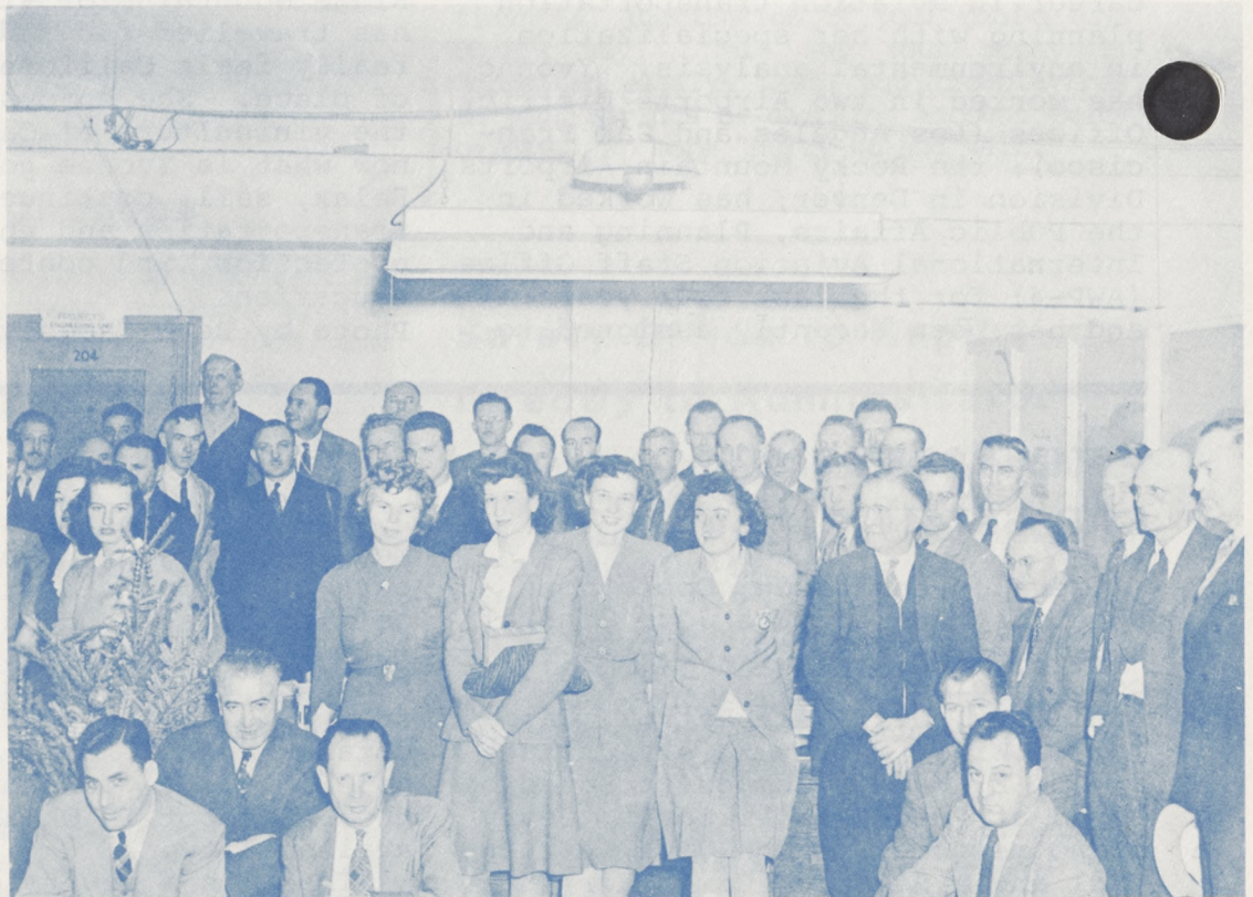
The date is Christmas eve, 1943. The photo represents the "Old CAA/FAA Sixth Region Federal Airways gang" at Santa Monica, California headquarters. Recognize anyone?