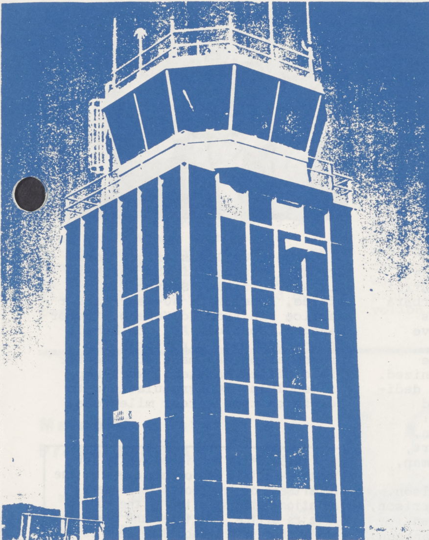
SANTA BARBARA TOWER/TRACON

ATCA Honors Santa Barbara Tower/TRACON With Award