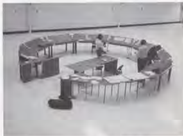
Controllers mocked up the cab console in an airport hangar to help develop ideas for improving its design.

The innovation went on. It was decided, for example, that the tower should not be consigned to a remote part of the field but rather be a center of activity around which all