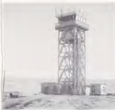
On the barren top of the world stands the control tower at Thule Air Base.