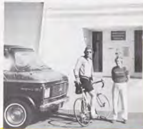
On the down side of the Continental Divide, he visited the Pueblo, Colo., Tower.