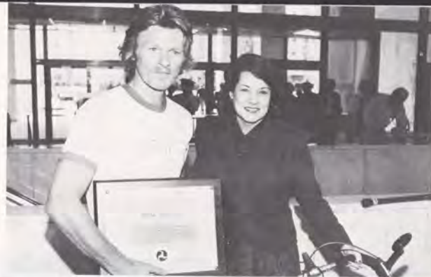
Although he dipped his wheels in the ocean at Ocean City, Md., the official conclusion of his 3,300-mile journey was at FAA Headquarters, where DOT Secretary Elizabeth Dole presented him with a Certificate of Appreciation.