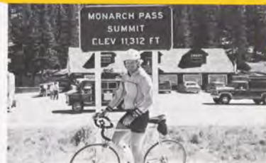
The Highest point on his trip was at Monarch Pass, west of Colorado Springs, Colo., but the worst pedaling was behind him.