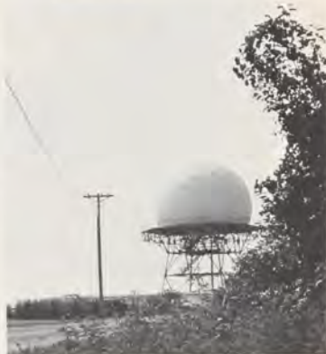
The Haleyville, Ala., ARSR, an FPS-67 located in the Bankhead National Forest, once looked down on the Panama Canal.