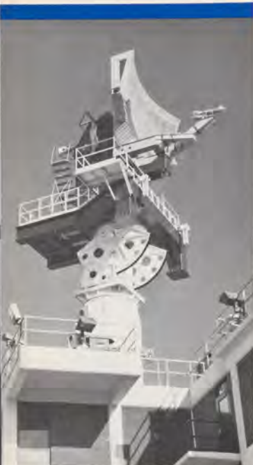
The first production system of the Westinghouse ASR-9 Airport Surveillance Radar is being tested by the company near Baltimore-Washington Airport. The first of 132 FAA and DOD systems will go to Huntsville, Ala., for FAA testing in July 1986. The new radar will detect six weather levels, low-flying aircraft and aircraft on tangential courses.