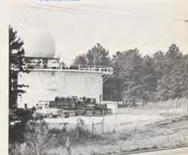
The Atlanta, Ga., long-range radar does not sit in isolation atop a mountain but next to a busy highway in Marietta.