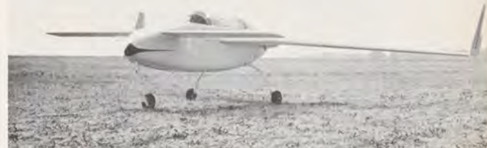
A Rutan Vari-Eze of the type involved in the save. It has a canard wing, winglets and a pusher propeller.