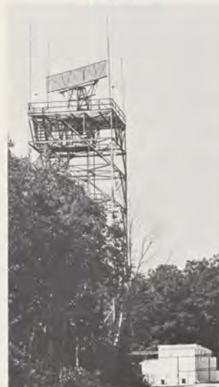
The Crossville, Tenn., beacon-only radar in the Crab Orchard Mountains atop the Cumberland Plateau serves the Atlanta and Memphis, Tenn., centers.

Lonesome. The last—at the intersection of Routes 674 and 39—is the nearest neighbor of FAA's Fort Lonesome long-range radar.