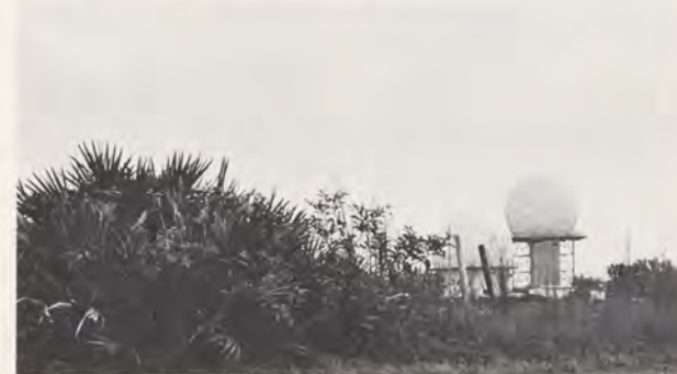
The Fort Lonesome ARSR-3 shares its site with an Air Force height finder radar amid the grasses and palmetto bushes.