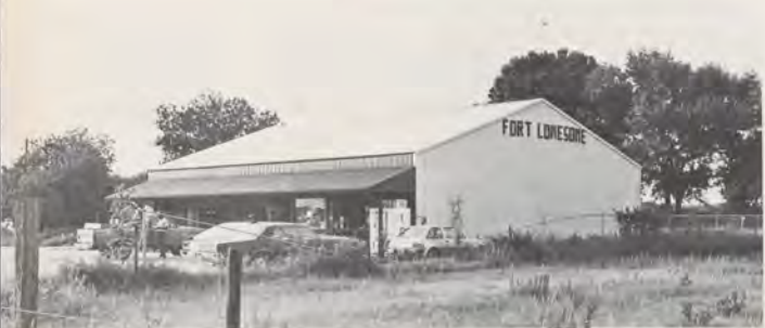
This is Fort Lonesome, Fla.—all of it.