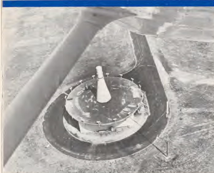
Another "80s Maintenance Program" element is the converting of VORTACs to high-reliability solid-state electronics,