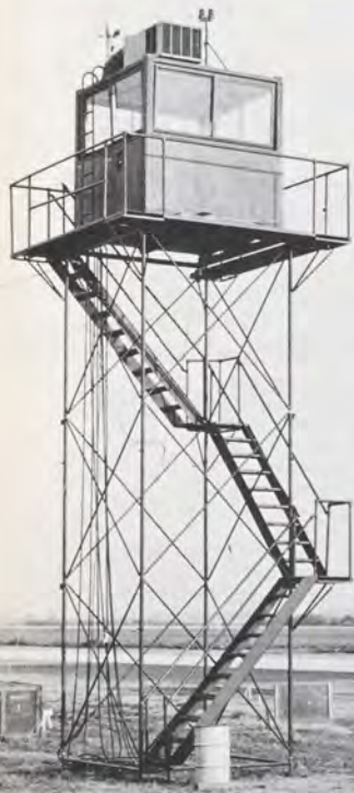
Camarillo Airport, 65 miles west of Los Angeles, received a temporary Marine Corps tower for the duration of the Olympics. It was staffed by seven controllers from around the region.

■ In addition to assuring dependable communications and navigation aids, Airway Facilities personnel designed a mobile "digital, voice discrete secure system"—a special FM communications network between themselves and Civil Aviation