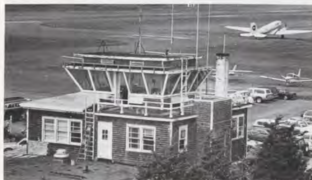
From the cab of the three-year-old 50-foot tower is a view of the old tower cab and operations building now used for office space.

may call out 'not in sight, cleared to land.' What's happened is that the pilot actually sighted Nantucket Airport [on another island] and is landing there.