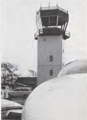
Martha's Vineyard Tower, a Level I turn-key-type structure, far outstrips its classification each summer.

"It's not rare that an aircraft has trouble finding Vineyard Airport," he said. "Often a pilot will call in for a landing, and you begin to look for him. You start counting heads. If you don't see him after some time, you