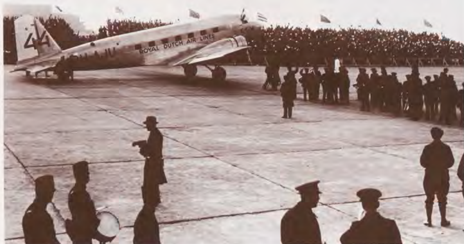
KLM's DC-2 at Schiphol Airport, Amsterdam, in October 1934. Called Uiver (Stork), this participant in the MacRobertson race was the first DC-2 in Europe.

The U.S. Proved Its Certification System Half Century Ago