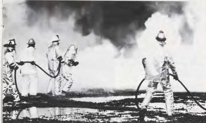
A highlight of the Southern Region's Airport Certification and Safety Conference was a 'hot fire' demonstration. Airport operations personnel and reporters suitably garbed used water and foam to put out the 500-gallon fuel fire.