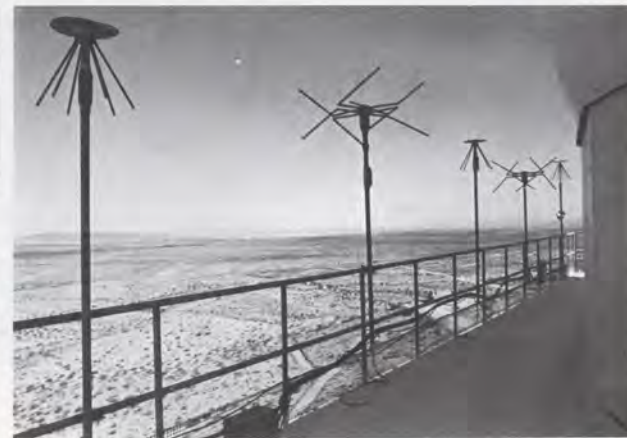
The Boron Long Range Radar is remote like most of its ilk, sitting in the midst of the desolate Mojave Desert. But this facility, which serves Edwards Air Force Base and the Los Angeles ARTCC is unique. It looks down on and sits on the property of the federal prison at Boron. Of course, the building is off-limits to its neighbors.