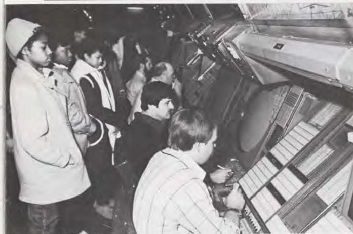
Hine Junior High School students monitor controllers at work in the Washington ARTCC, Leesburg, Va.

Support for FAA's Aviation Education Program essentially is in the hands of regional Aviation Education Coordinators and hundreds of Aviation Education Facilitators, who in their communities become the voice of FAA. Their numbers are expected to swell to nearly 3,000 by the end of 1984.