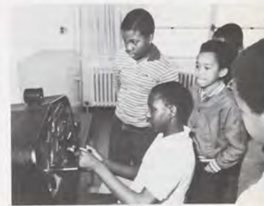
"Hands on" is always appealing, and here Hine Junior High School students get the feel of flying on FAA's simulators at Washington National Airport.