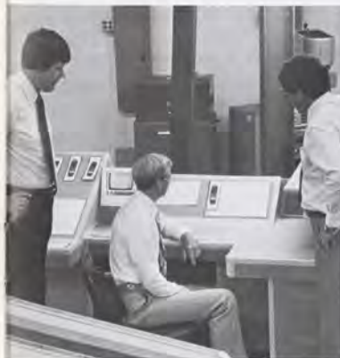
A final check is made from the planners' standpoint of the kneeroom and workspace in an area supervisor's position.

Despite careful advance planning—which, for example, determined that more room could be provided for additional instruments or that visibility could be increased or that controllers could be helped to work standing or sitting more conveniently—changes had to be made after the mockup was completed. Of course, that was the purpose of the whole exercise.