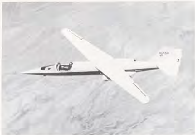
Rutan built this oblique wing (skew wing, scissors wing, swing wing) for testing at NASA's Dryden Flight Research Center. Called the AD-1 (Ames/Dryden), the research vehicle has a wing that can pivot up to 60 degrees from perpendicular to the fuselage and is proving its projected stability, quieter takeoffs, higher speed and reduced-fuel capabilities. It's believed that a future oblique-wing transport could fly at 1,000 mph at twice the fuel economy of conventional SSTs.

Advanced turboprop engines, which can provide rides as comfortably quiet as jet passengers have become accustomed to, are being developed for commuter use. By using several thin, short propeller blades made of composite materials, ground noise is also significantly reduced.