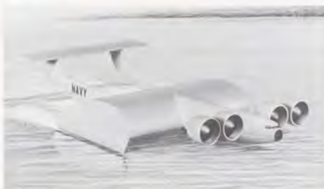
This wing-in-ground-effect aircraft is designed to transport a 220-ton cargo over an open ocean sea state 3 (up to four-foot waves) cruising at 300 mph. Power-augmented ram provides for takeoff.

The aircraft of the future will be odd-looking when compared with the familiar shapes of today. Whatever the shape, however, the American passenger can be assured that just as in the case of the Wright Flyer, there was a great deal of thought and planning put into the design before the aircraft was proved to be airworthy. ■