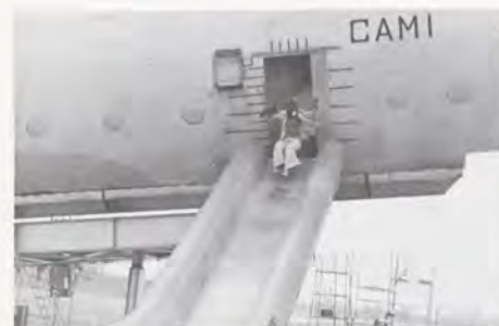
Workshop participants get the feel of jumping from a smoke-filled aircraft onto an emergency evacuation slide.

"... I don't think I was conscious of a whole lot of things I was doing. It just happened, and I reacted, and I did what I had been trained to do."