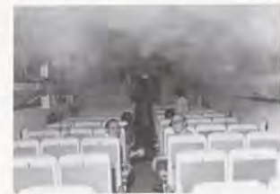
FAA air carrier inspectors get to experience emergency evacuation conditions as the interior of the CAMI aircraft cabin simulator is made to fill with smoke.

To facilitate communication, each workshop is limited to eight participants. Since 1975, when the program was started, more than 800 have at-