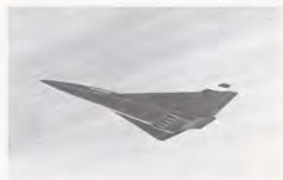
A dual propulsion hypersonic airliner has been studied by Lockheed-California for NASA. The liquid-hydrogen-fueled aircraft would use five conventional turbojets as boosters for five superersonic combustion ramjets to move it at 4,000 mph at 110,000 to 120,000 feet. Its range would be over 5,400 miles.