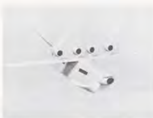
A blended-fuselage catamaran is a feature of this Lockheed-Georgia amphibian, which could carry a 63-ton payload. It could fly 3,200 nautical miles and, with its wing 26 feet above the waterline, could sit in a sea state 6 (20-foot waves). Hydroski assists takeoffs and landings.