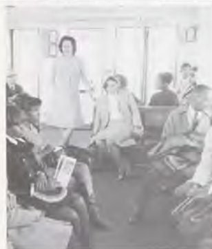
An attendant is provided for the commo-dious carpeted waiting room on wheels.

not only could use short runways but also could carry significantly more passengers at much less cost than any of the earlier prop airliners.