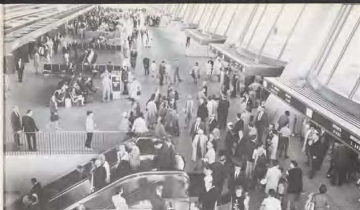
The field side of the Dulles terminal. At right are the departure gates—all of them—to the mobile lounges. The escalators service the baggage arrival area.

These planes were only the forerunners of a whole generation of jets that