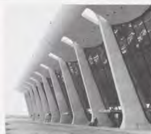
Detail of the supporting piers.

The team's analysis of airport design focused on the widespread practice of building branching covered walkways onto the terminal that cre-