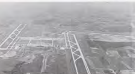
Aerial view of Dulles showing its parallel runways. The aircraft parking and service area is the horizontal light-colored strip beyond the tower and terminal.

Perhaps more significant for Dulles' future was work begun in October of 1981 for the completion of a 3.4-mile extension of the Dulles access road in-