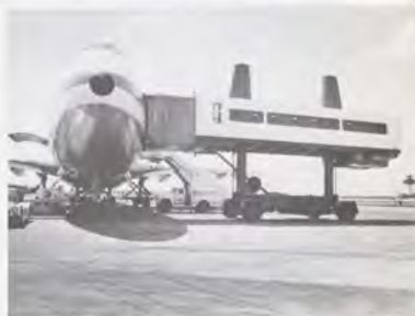
One style of mobile lounge does not use adjusting ramps to mate with aircraft but jacks itself up instead.

in November 1962, it seemed to be assured of a brilliant future. It was planned to handle the first jet airlines, which were all heavy, long-distance, four-engine types, including the Boeing 707, Boeing 720 and the DC-8, which could not use National's short runways.