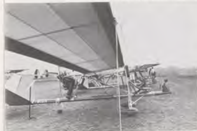
Maxair Sports' Hummer uses a single-tube fuselage. Its pilot sits way out front.

The Pterodactyl Ptiger, like its stable-mate and the XTC, carries a canard wing.