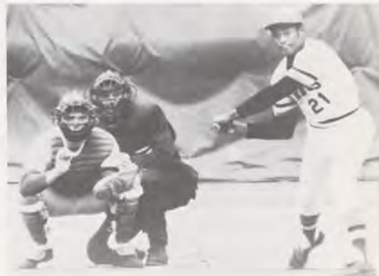
A star on and off the diamond, Pittsburgh Pirates center fielder Clemente tackled life with "passion" and "compassion," according to pitcher Tom Seaver.

On Dec. 23, 1972, an earthquake ripped through Nicaragua. Charged with the spirit that made him a great athlete and a national hero in Puerto Rico, Clemente formed a committee to collect food and medical supplies for the disaster victims. The Puerto Rican people responded so magnani-