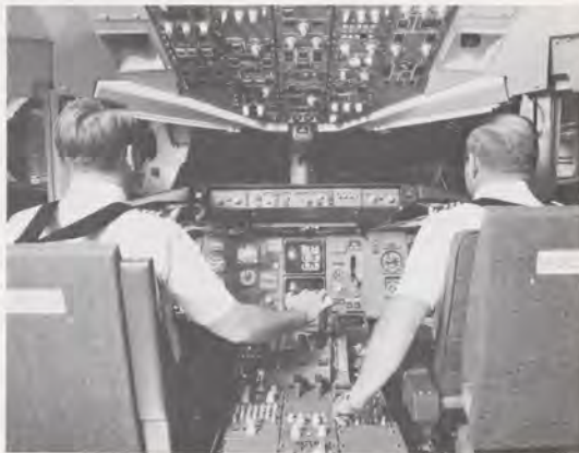
Eastern Air Lines acceptance pilots fly a Phase II simulator for a Boeing 757.

The second major cause of accidents related directly to visibility problems. Prior to advanced simulation, most simulator visual systems were capable