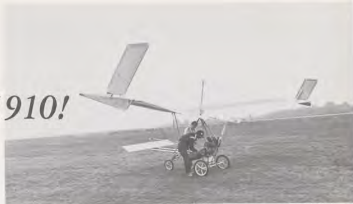
The Pterodactyl Ascender uses ruddivators, which both turn and bank the craft.

Evolved out of an unpowered hang-glider, the Quicksilver MX protects its pilot with a streamlining nose cone.