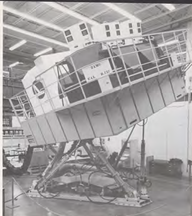
An exterior view of Eastern's Boeing 757 Phase II simulator.

and felt much more frequently. After takeoff, we got the sound and feeling of the gear retracting.