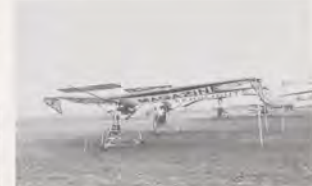
The American Eagle uses weight shift like a hang-glider instead of controls. Its wings carry ruddivators.