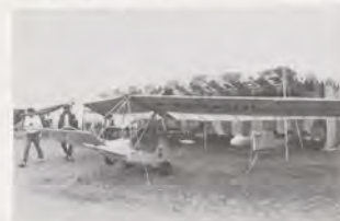
Flight Designs' Jet Wing (below) has a conventional delta wing like a hang-glider and is flown either as a hang-glider or a powered ultralight.

The Pterodactyl Ptiger, like its stable-mate and the XTC, carries a canard wing.