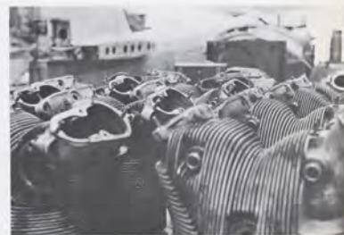
Rows of radial-engine cylinders wait in a workshop for reinstallation in a World War II Japanese Nakajima "Irving" being restored by Smithsonian craftsmen.

After the decades of neglect are removed, the planes are restored from nose to tail. The spruce fuselage of the ancient Douglas World Cruiser, for example, was recently restored to the