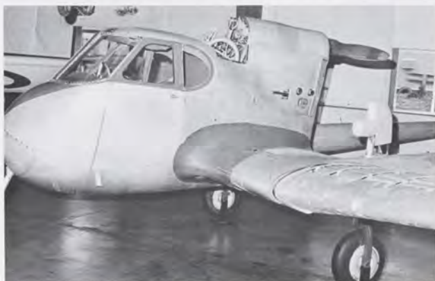
With a tricycle landing gear, the Stearman-Hammond of 1937 was everyman's safe plane, but it didn't survive that year's recession. Only 50 were produced.

there are over 100 other historic airplanes displayed at the National Air and Space Museum (NASM) in Silver Hill, Md.