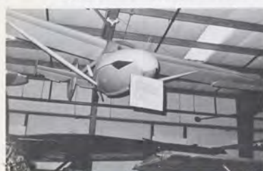
Born as the Bumblebee, the Nelson Dragonfly was a powered sailplane in 1947, perhaps the only such to be certificated by the CAA then or since.

Like a great painting or a rare book, the historic aircraft is restored as closely as possible to mint condition so observers can understand the designer's contribution in the technological context of the time. Silver Hill workmen finish about four airplanes per year and are forever working in different materials to hone their skills. They strive to preserve every square inch of