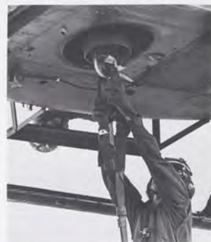
Sp4 Files "snaps a loop" to a chopper's hook for transporting a load of scrap.