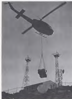
Another load of materials is delivered to the mountaintop, with a drogue parachute to stabilize the load.