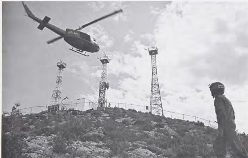
Air Force Sp4 David Files watches a Huey helicopter drop the strap on a load of construction materials delivered to the FAA facility atop Mount Franklin.