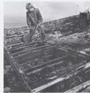
A load of burned out wall panels are stacked on a sling by Sp4 Files.