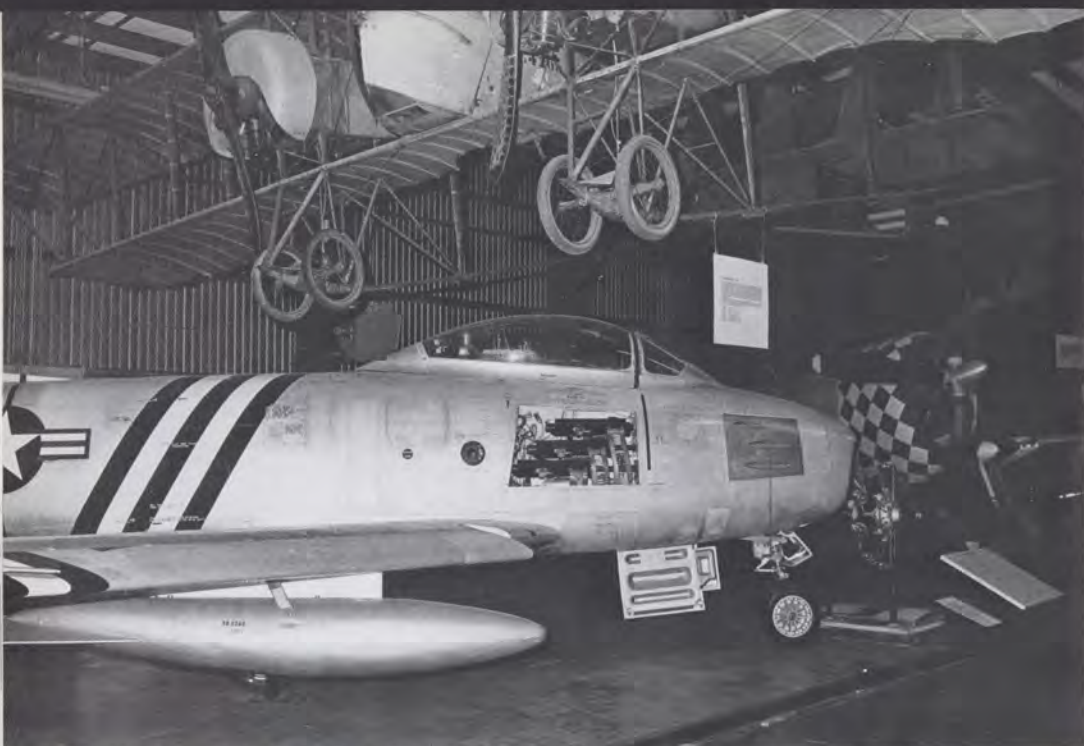
Displays are not by era, and striking contrasts are made. A World War I Caudron G-4 bomber "flies over" a much larger Korean War F-86A fighter.