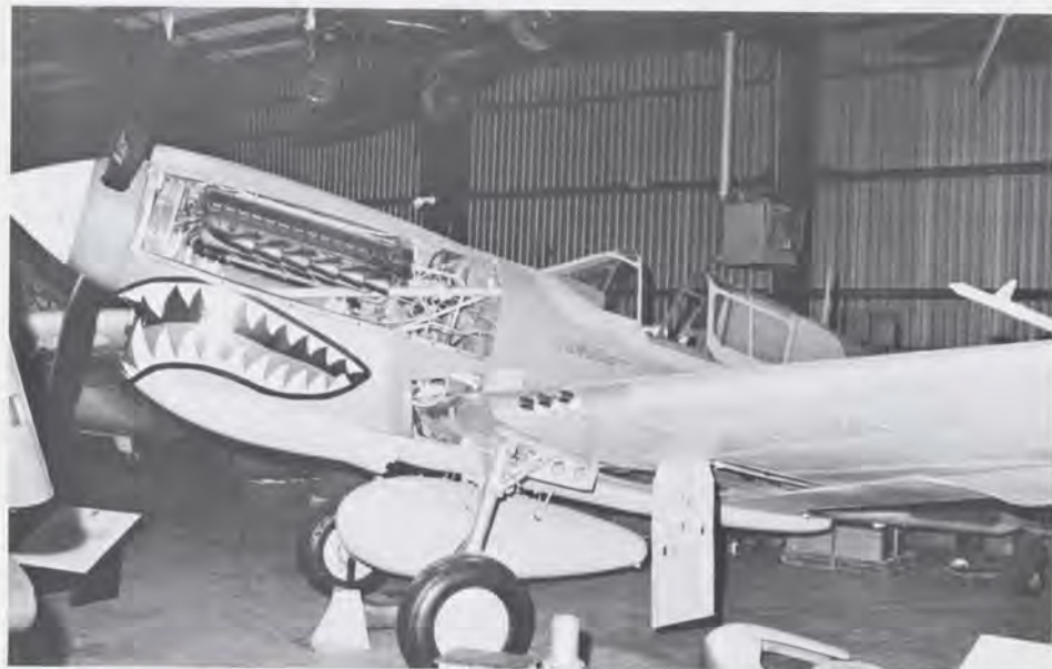
Among the many bygone military and civil aircraft on display is this P-40E in the colors of the Flying Tigers.