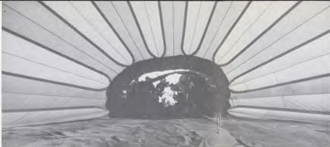
The crew of a hot-air balloon inflates the envelope as it lies on the ground.

The Flight Service Station publishes a notice for pilots prior to the fiesta, sends letters to all New Mexico FSSs