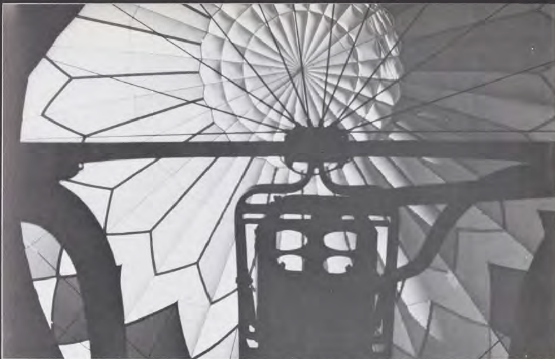
Balloonists await a launch signal from officials just after dawn. There were five waves of launches of about 60 balloons each at 15-minute intervals.