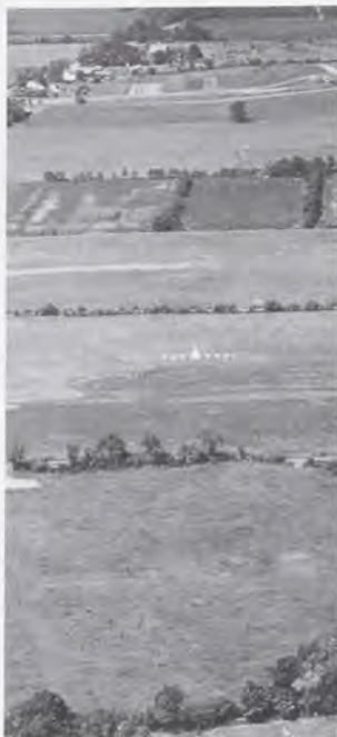
But for the new airport identifier in the center of the photo, a pilot approaching from this direction wouldn't know that he was nearing the Pleasant Valley Airport near Allentown, Pa.

At the top of the list of requirements was a pilot's ability to locate an airport. Others were airport identification, runway selection, circling guidance, final approach guidance, touchdown and rollout guidance and runway exit identification and taxiing procedures.