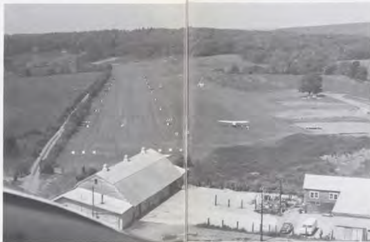
Aligned with the runway by the airport identifier's markers, a general aviation pilot comes in for a landing aiming for the POMOLA that appears as a single panel opposite the identifier.