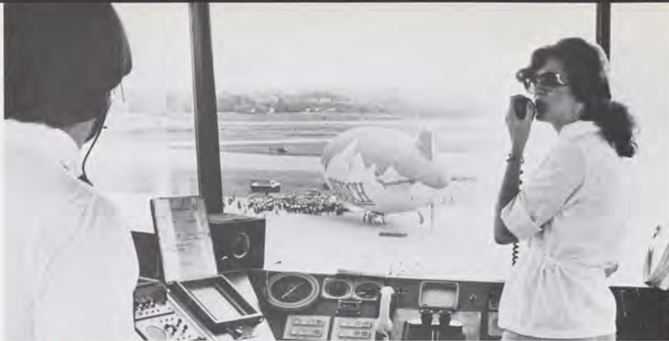
Controllers Bill O'Brien and Mary Peters are confronted with unusual traffic on the ramp at Hanscom Field in Bedford, Mass. It's the Good Beer Blimp Busch, the largest thermal airship in the world.

want to utilize a heavy-lift aerostat for other cumbersome short-haul operations, precision placement of prefabricated towers or girders and loading of container vessels away from crowded ports or near cities with shallow harbors.