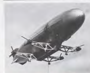
An artist's rendition of the hybrid Piasecki Heli-stat, which would combine the lifting power of a non-rigid airship with four helicopters. It's being developed under a Forest Service contract.

The zeppelin's metal framework maintained the shape of this floating luxury liner of the sky, which could accommodate more than 100 travelers and was