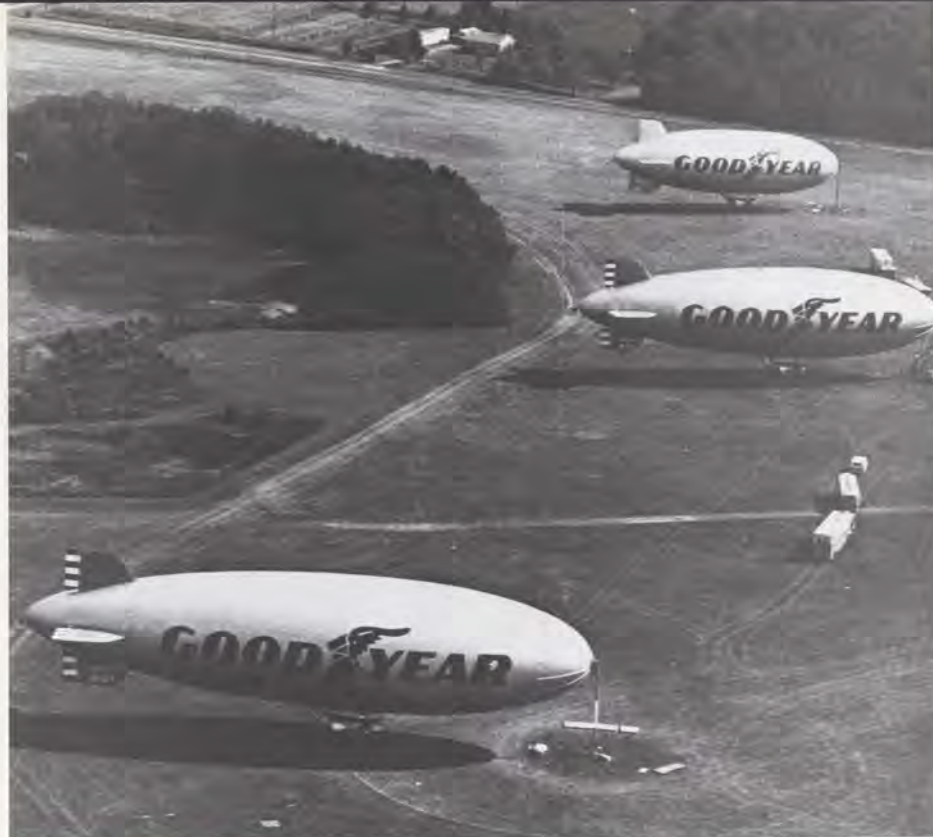
The Goodyear blimps (from top to bottom) Mayflower II, Columbia and America are likely the only airships that Americans have seen in the skies in many a year.

Although they have not yet set up programs of their own, the Immigration and Naturalization Service, the Law Enforcement Assistance Administration, the