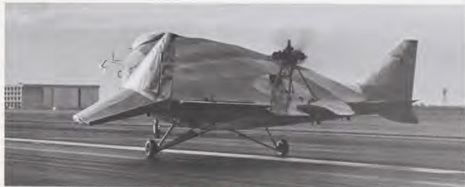
The Aereon 26—the "Deltoid Pumpkin Seed"—a lifting body that combines aerodynamic and aerostatic qualities—made six successful flights to 1,000 feet at NAFEC in 1970. With helium added, it could reach higher altitudes.