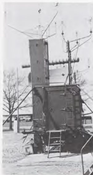
Mobile system or not, the communications side requires a maze of antennas.

replacing it. The system consists of three vans for radar equipment, communications equipment and operations—the TRACON, that is. The radar has a primary range of 60 miles and a secondary range of 200 miles and produces five video map displays simultaneously. Each position has full VHF and UHF radio with 20 channels. A fourth trailer has been added to serve as an office for the Airway Facilities radar unit chief and as a briefing ready room for controllers.