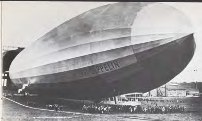
The 20-day circumnavigation of the globe by the Graf Zeppelin I in 1929 inaugurated the heyday of the dirigible. It was more than 774 feet long, 100 feet wide and could cruise at 71.5 miles per hour.

Although the Aereon Corporation still hopes to market a full-size deltoid heavy-lifter, it has not yet raised the necessary financing.