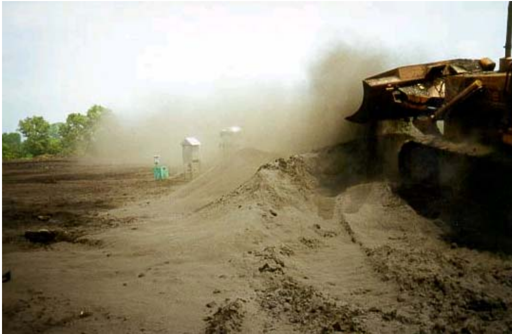
Figure 3.3 : Worst case scenario dust generation at the sampling site.

To create a road-laying environment and a relative worst case scenario, a bulldozer, front end loader and dump truck were used to move waste sand around the monofill and to raise and dump sand loads. This generated copious dust clouds that rolled across the samplers as seen in Figure 3.3.