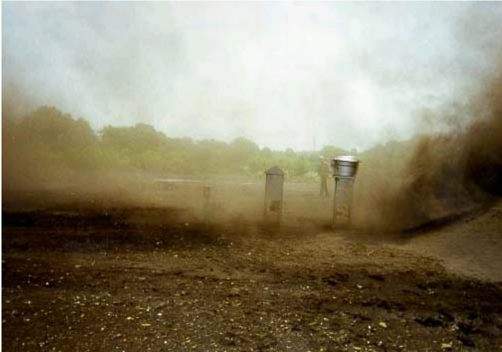
Figure 3.4: Simulation of worker exposure at the sampling site.

The personal samplers were run for a 2-hour period. Four sets of filters were changed on the TSP and the PM-10, and three sets of samples were taken with the High-Volume Anderson Sampler on the first day of sampling. Additional samples were obtained during the second day of sampling.