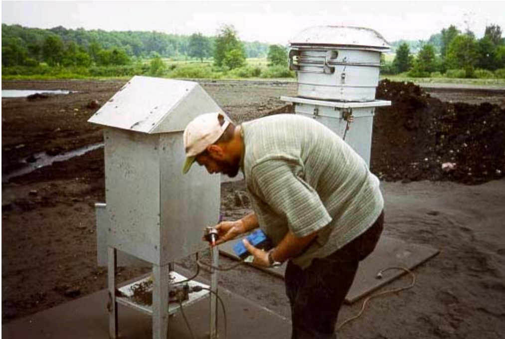
Figure 3.2. : Equipment set-up at Auburn sampling site.

The equipment was set-up in a flat, level area in the middle of the monofill to simulate the level area at a road laying and construction site. As seen in Figure 3.2, all three area samplers were kept in close proximity of each other so that their results could later be compared and correlated. A steady wind with fluctuating direction blew on both days air sampling was conducted. The samplers were placed such that the plume of dust from the manipulated waste foundry sand always traveled directly to the samplers.