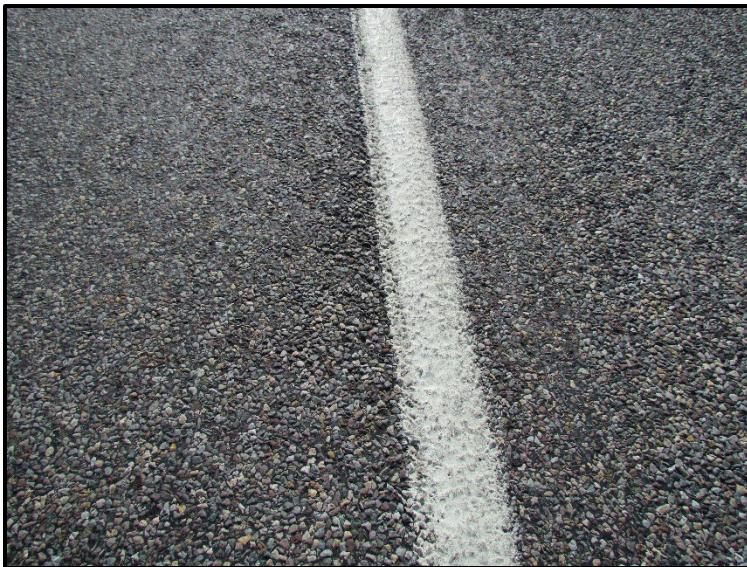
← RP 12, close-up view of the chip seal condition at the fog line.