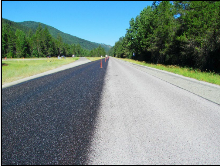
← Representative image of FSCS application in progress.