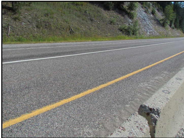
← RP 8, westbound, view east.