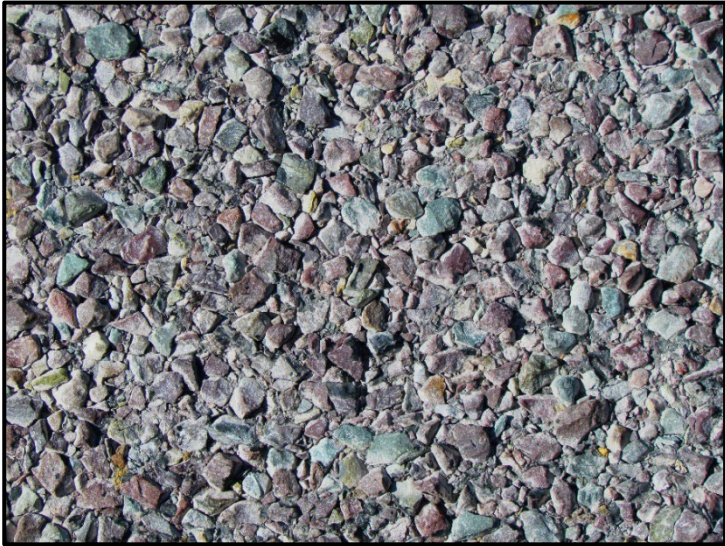
← Close-up of chip seal using MDT Type III aggregate with CHFRS-2p emulsion.