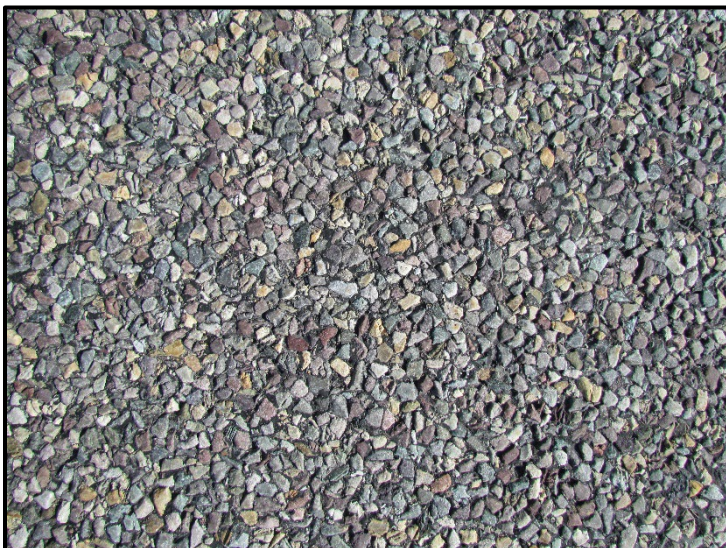
← RP 8, close-up view of the chip seal surface.