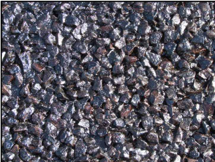
← Close-up of completed FSCS application with CSS-1h emulsion.