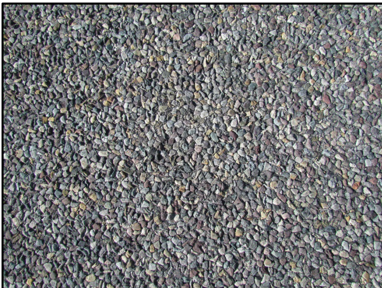
← RP 12, close-up of the chip seal surface.