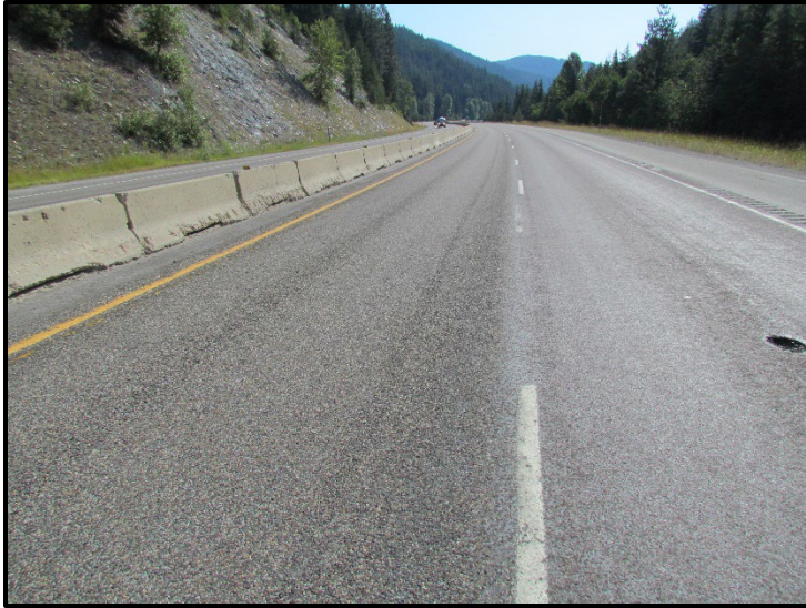
← RP 8, eastbound, view east.