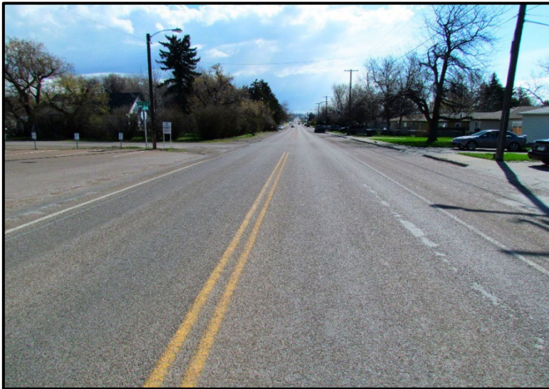
← West end of project; view east.