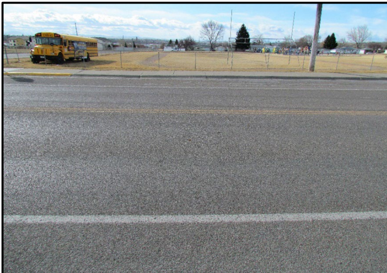
← Transverse view of pavement.