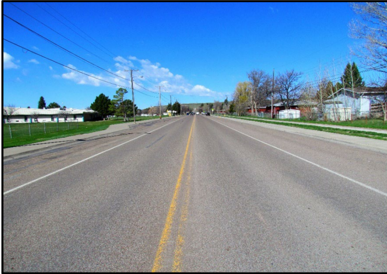
← East end of project; view west.