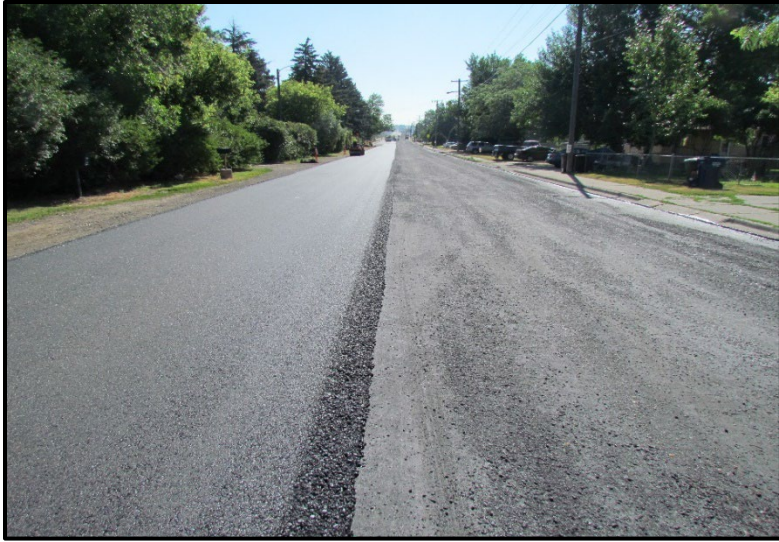
← Representative image of completed paving pass, view west.