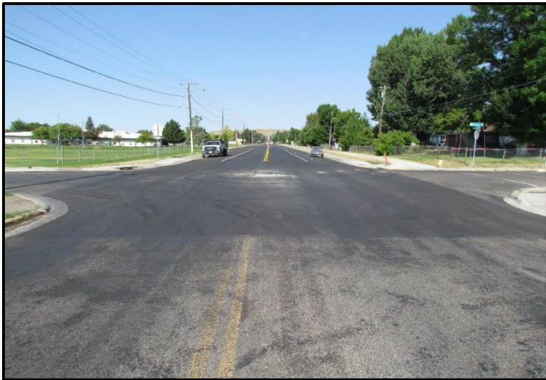
← Completed project, east end, view west.