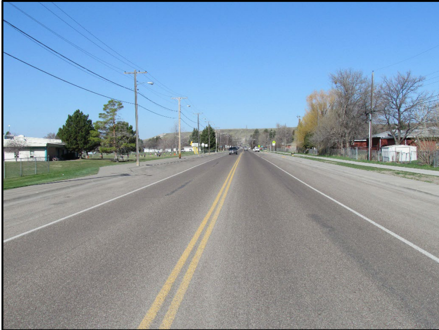
← East end of project; view west.