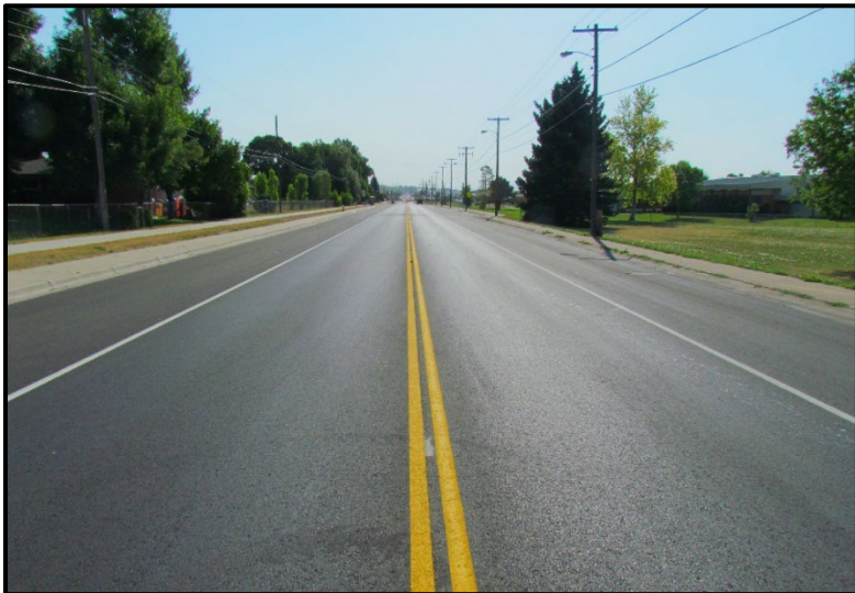
← Completed project, west end, view east.