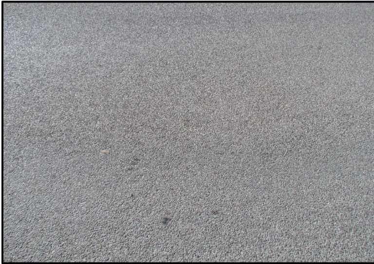
← Example of pavement surface condition.