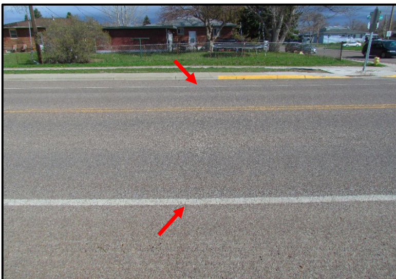
← Although difficult to see in this image; one low-severity longitudinal crack has appeared on the project near Riverview Blvd intersection (red arrows).