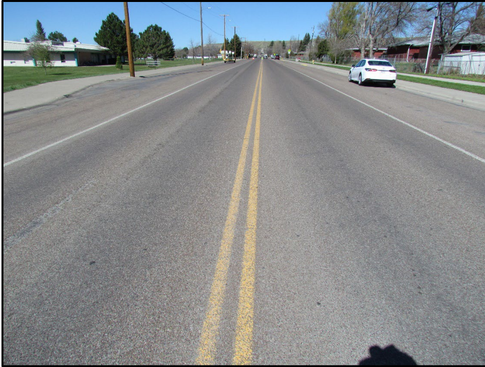
↑ 1 st Street NW, view west.