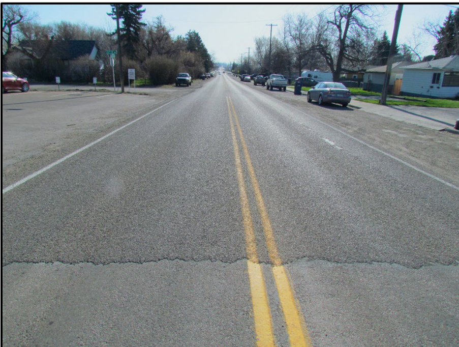
← West end of project; view east.