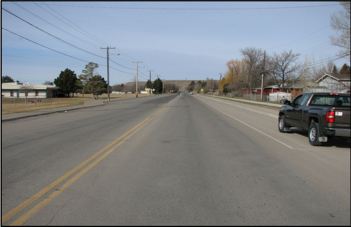
↕ Project section prior to milling phase; top picture is Smelter Ave & 1 st NW, view west. Lower image Smelter Ave. & 5 th St. NW, view east.