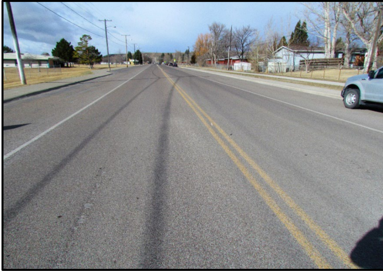
← East end of project; view west.