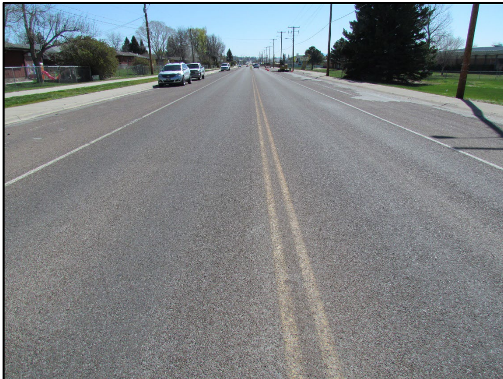
↑ Riverview Boulevard, view east.