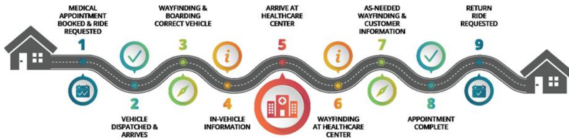
Figure 1. Overview of Health Connector System Concept

HIRTA was awarded a Phase 2 agreement of the Complete Trip - ITS4US contract for its proposed concept “Health Connector: Bridging the Gap Between Healthcare and Transportation” (Health Connector) by the United States Department of Transportation (USDOT) to showcase innovative business partnerships, technologies, and practices that promote independent mobility for travelers regardless of location, income, or disability.