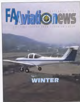
FRONT COVER:1981 Tomahawk II produced by the former Piper Aircraft Corp.