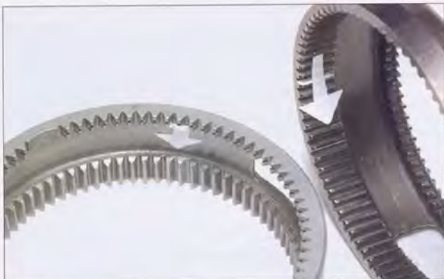
(Top) An operator tried to build "new" teeth in this ring to replace broken ones by welding in metal and filing it down to match the others in this SUP's ring. (Bottom) Sometimes it is hard to tell a good part from a bad one just by looking without knowing what a good one looks like.

craft part does not conform to its approved design (consistent with the drawings, specifications, and other data that are part of the type certificate, supplemental type certificate, or field approved alterations), it is uncertain how the part will perform when installed. An installed unapproved part increases risk, reduces safety, and could introduce an unexpected threat to an operating aircraft.