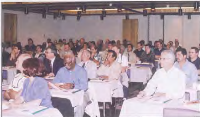
Participants from many of the Greater Miami area maintenance shops and repair stations attended the Third Annual "Miami 2001 International Suspected Unapproved Parts" Safety Seminar to learn more about how to detect or avoid the use of such parts.