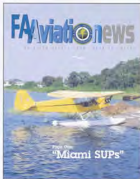
FRONT COVER: A classic J-3 Cub on floats.