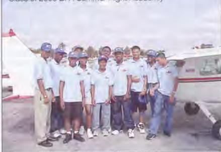
Class of 2000 BPA Summer Flight Academy

amount of scholarships given is not far from the one million-dollar mark.