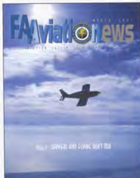
FRONT COVER: Are you ready for the flying season?