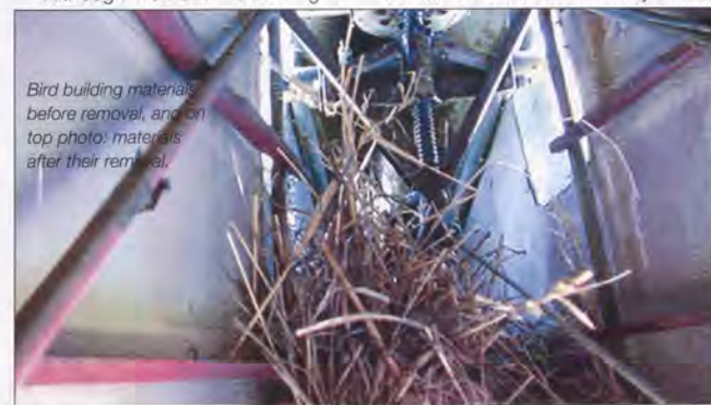
Bird building materials before removal, and on top photo: materials after their removal.

Third, the sheer volume of material carried into the aircraft in a day or two