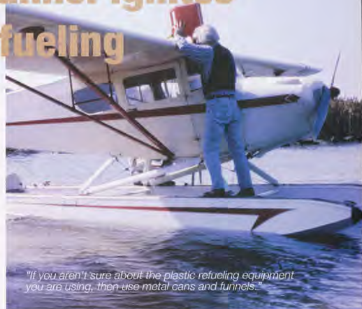
"If you aren't sure about the plastic refueling equipment you are using, then use metal cans and funnels."

A horror story on refueling practices concerns the pilot of a Cessna 172, who performed an act of environmental friendliness during his preflight check by draining about a liter of fuel from each tank into a metal can. The fuel appeared clean and free from water so he decided to pour it back into the aircraft tank, using a plastic funnel with a chamolis wired to the funnel in an attempt to dissipate static. While pouring the fuel he noticed flames around the filler neck. He managed to put them out using the entire contents of one fire extinguisher and most of a second and suffered third degree burns to one hand.