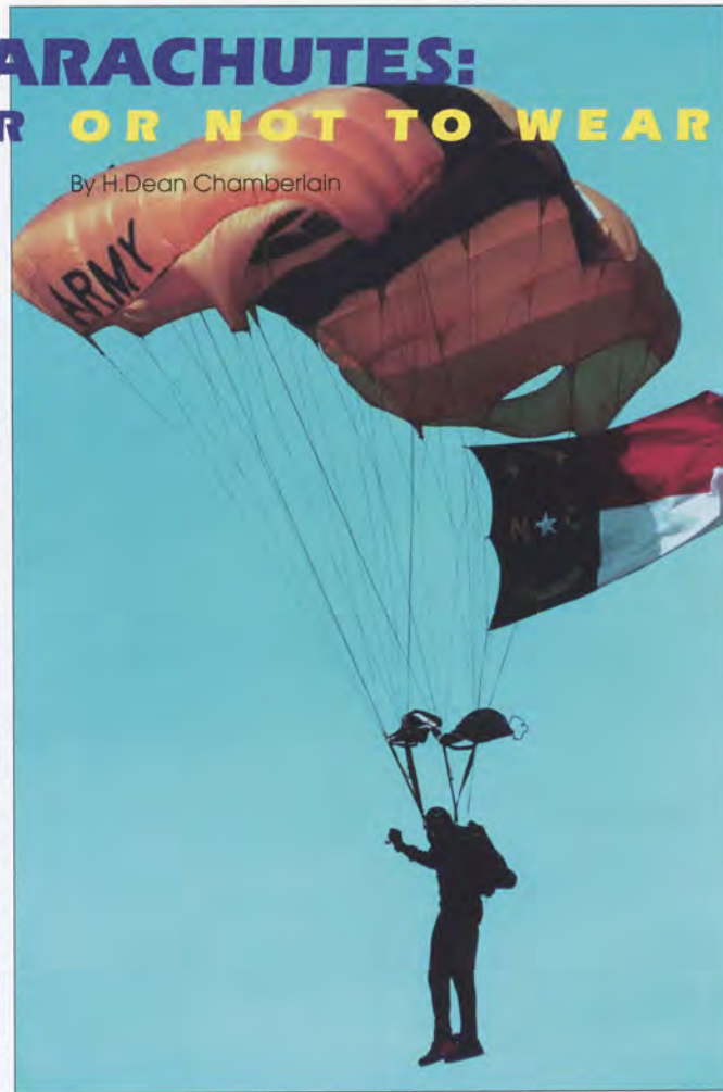
Ram-air style parachute canopies provide great maneuverability. Although used primarily by sport skydivers, such as this one being "flown" by a member of the U.S. Army Parachute Team, the Golden Knights, ram-air style parachute canopies can be custom ordered in some emergency parachute rigs.

So why am I writing about parachutes? There are several reasons. Once in my life I gave some thought to skydiving. Fortunately, the thought passed before I could embarrass myself. I even did an article about skydiving and skydiving safety which highlighted the important role the United States Parachute Association (USPA) plays in sport parachuting. That article was published in the January-February 1994 issue of FAA Aviation News as part of our special FAA and Industry series. The ar-