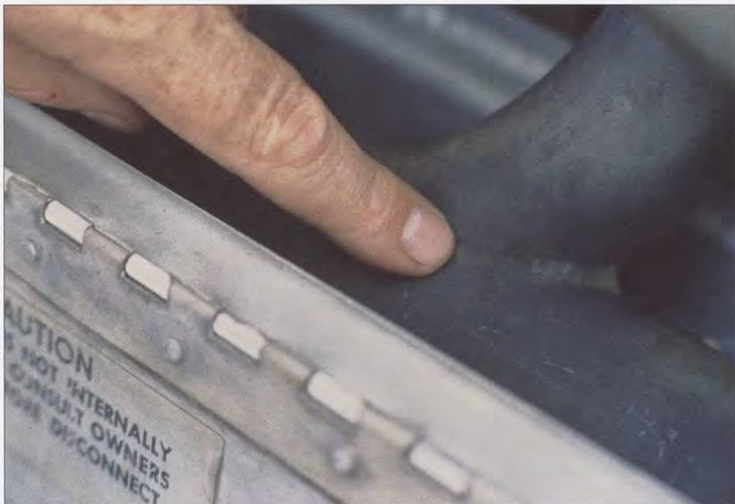
The aircraft's exhaust system should be thoroughly inspected by a knowledgeable maintenance technician for any signs of exhaust gas leakage, such as cracks in the pipes or in welding.

formed. That risk exists not only in flight but on the ground as well. For example, a gasoline powered tug is running outside a small hangar or an aircraft engine is being tested in a hangar or a small gasoline engine pre-heater is being used to warm an aircraft's engine before the aircraft is moved from its hangar can all expose anyone within the enclosed areas to the danger of CO poisoning. Since the effects of CO are cumulative over time, even this type of exposure can put a pilot at risk. For example, let's add in a planned late night flight. We will say the pilot smokes. The pilot is planning on flying at 10,000 feet MSL. Throw in a little CO, and, when all of this is computed in the pilot's body, that pilot is at risk for the dangers of CO—and, to be really precise, to the danger of hypoxia.