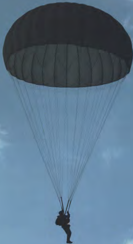
The traditional round canopy is the style of parachute familiar to most people. Used in military and civilian parachutes for decades, the round canopies used in today's civilian emergency parachutes can be ordered in various sizes, porosity, and descent rates.

development of parachute equipment and safe parachute operating practices for both sport and emergency use.