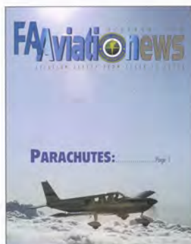
FRONT COVER: Flying in winter poses unique survival situations. See page 8. BACK COVER: Piper Warrior II.