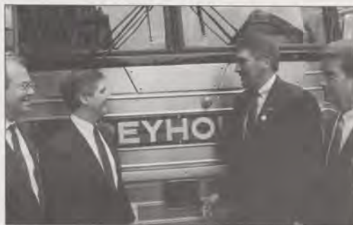
Secretary Card with Greyhound and VORAD officials.

Representing the Department of Transportation at the event was Secretary Andrew H. Card Jr., who praised the Greyhound/VORAD agreement, saying, "the partnership being activated here is just the kind of public-private partnership the President is