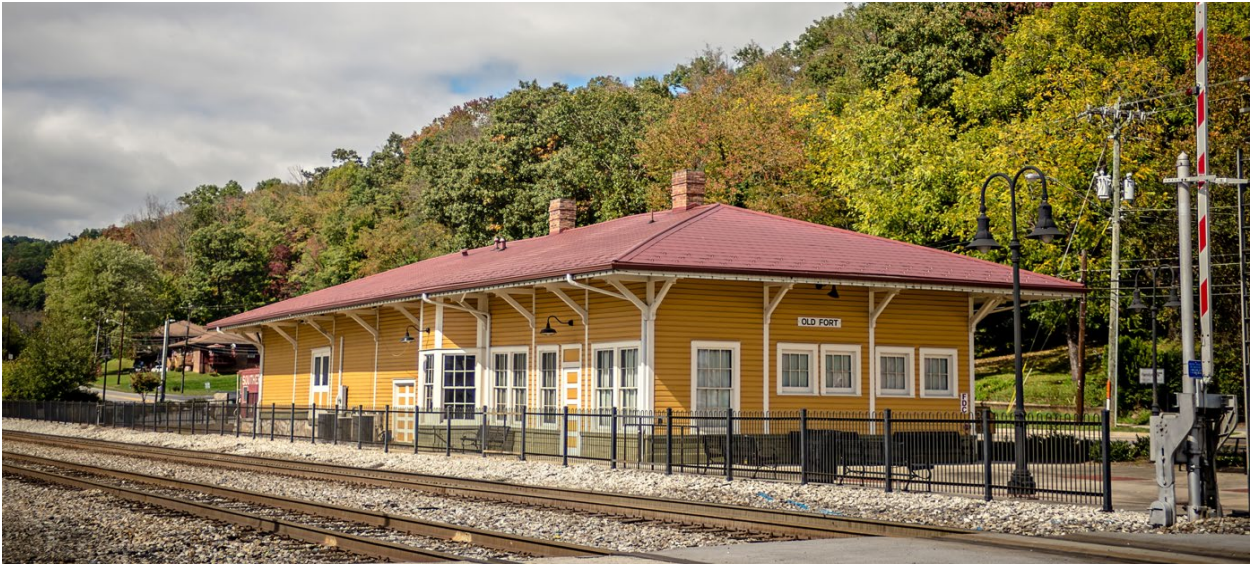
Figure 2. Old Rural Train Station Along the Proposed Corridor