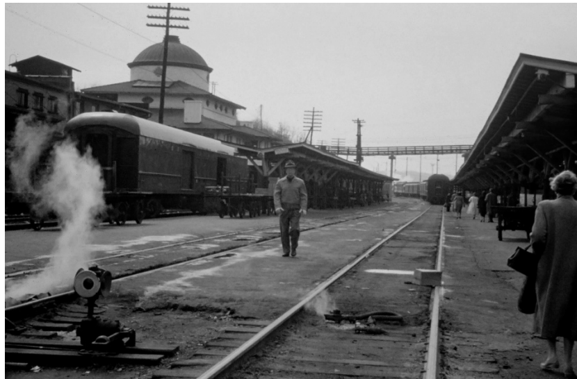
Figure 1. Southern Railway's Historic Asheville Station