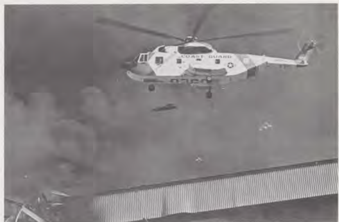
Carrying blast victim in rescue basket at end of cable, Coast Guard helicopter 1484 flies from billowing smoke to safety in dramatic 1977 rescue operation. Two helicopter crews (below) shared eight medals for their heroism during the operation.

A tragic irony of the rescue came when LCDR Charles Peterson, operations officer of the Belle Chasse air sta-