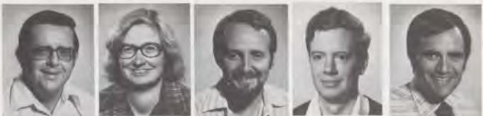
JADAMEC EASTWOOD SANER FRAME FORTIER