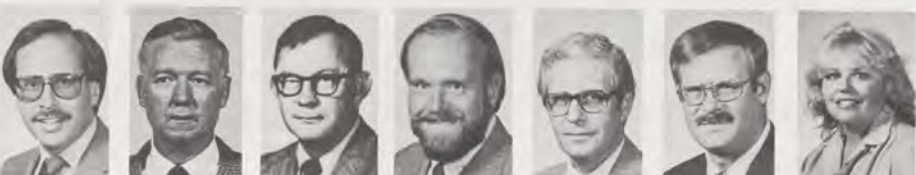
SELFON SHADWELL SHRIEVES SWINBURN TRILLING TUCKER UNDERWOOD