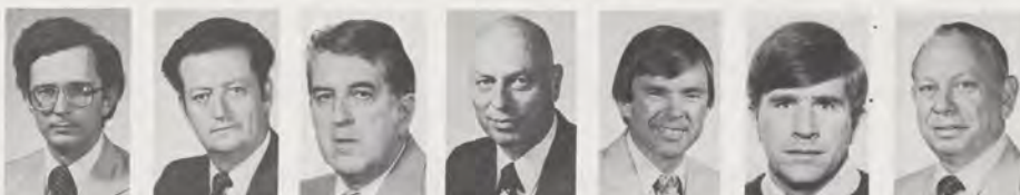
COTHEN CUDAHY DEMETER DENSMORE DOOLAN ELLIS EPHRAIM