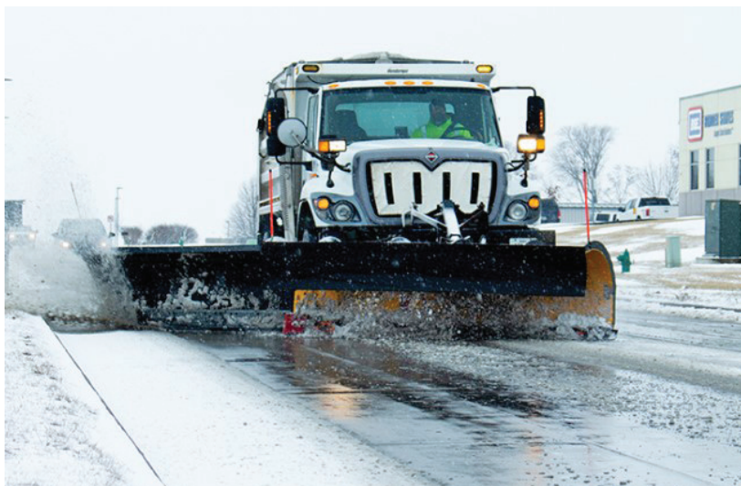
City of Ames, Iowa

Biodiesel is domestically sourced and can reduce transportation energy costs and harmful emissions. However, it has a lower energy content than petroleum diesel, can gel in very cold temperatures, and at higher blends can act as a solvent that releases deposits accumulated from petroleum diesel, clogging filters.