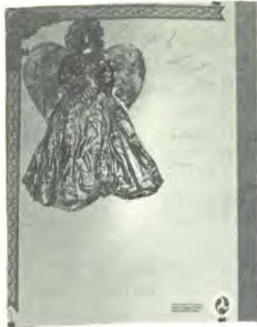
Poster Greeting Card that was handcarried to Children's at Christmas.

NHTSA employees donated a generous $550 to Children's Hospital this year, $50 more than last year, in lieu of exchanging greeting cards.