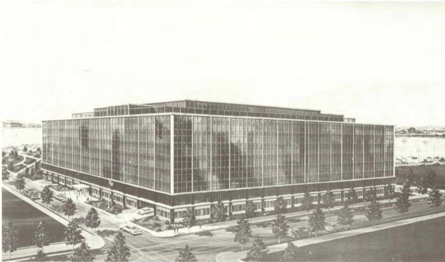
Artist's rendition of completed Buzzard Point Building (2100 Second St., S.W.)