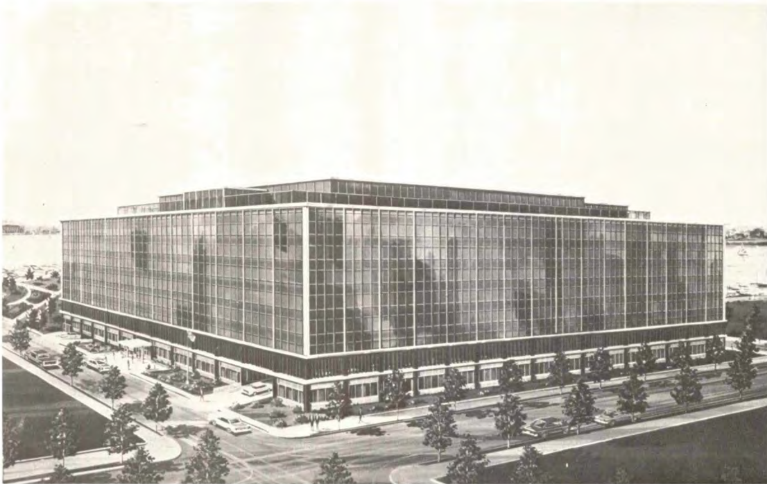
Artist's rendition of completed Buzzard Point Building (2100 Second St., S.W.)