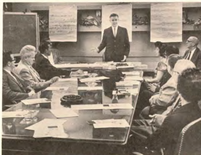
FA Club Introduction to Investments Course