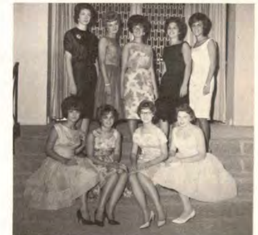
and More Girls