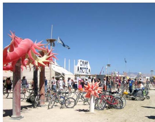
Scenes from the Burning Man festival at Black Rock Desert NCA.

Several BLM sites experience significant peaks in visitation during one specific time period, usually associated with a special event. While regular or even seasonal ATS may be unfeasible at these sites, agency staff can plan to integrate ATS into these peak visitation periods as a means to decrease congestion, lessen the environmental impact, and enhance visitor experience.