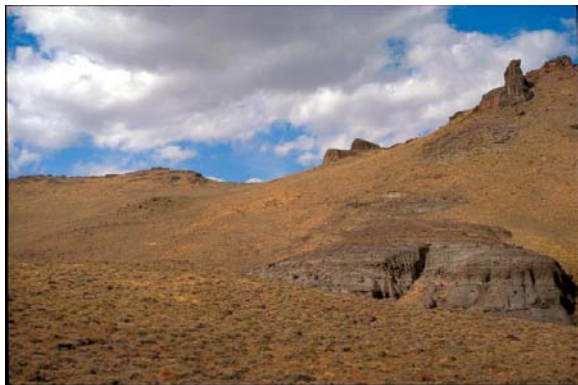
View from the Bloody Shins trail in Winnemucca, Nevada.

In most cases, staffing and funding at BLM field offices and sites are not explicitly structured to include ATS. Staff is not trained in ATS planning nor are they hired to fulfill ATS planning or implementation functions. The agency has limited dedicated funding for alternative transportation and most field office staff is unaware of how to access such funding. While many forms of ATS do not require a large capital expense, they do require some funding sources to support planning, implementation, and management. Funding for ATS is often pieced together from various governmental, private, and nonprofit sources. This funding tends to be inconsistent at the field office level, leading to project or study delays. Inconsistent