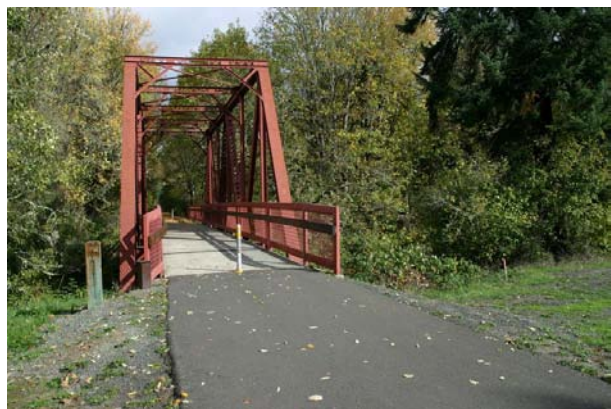
The 15.6 mile Row River Trail connects Cottage Grove, Oregon, to BLM lands.