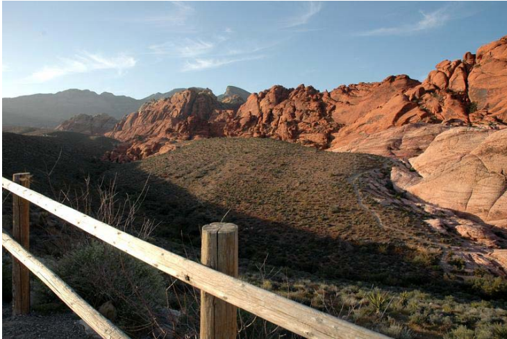
View from along the Scenic Loop Drive in Red Rock Canyon National Conservation Area.

Inventory research found no cases of government-owned shuttles operating on BLM lands, although there are instances in which the BLM contracts with a local transit company or private operator to provide shuttles to BLM visitors. For example, a private company offers shuttle service for cyclists and hikers on the Bizz Johnson Trail out of Susanville, CA, but staff out of the Eagle Lake Field Office found this