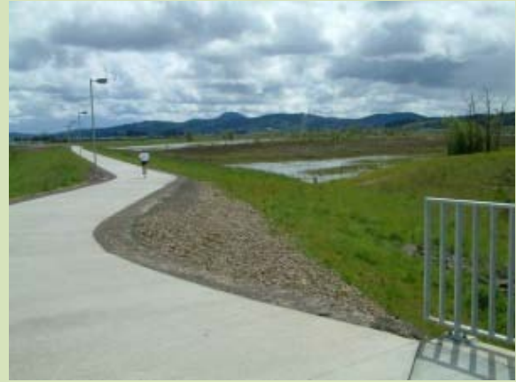
Bicycle and pedestrian trail in WEW.

WEW also features a 2.5 mile paved recreational path running through the site, which allows visitors to access several popular trailheads. This path connects seamlessly to the Fern Ridge Bike Path, which extends an additional four miles to downtown Eugene and allows visitors from Eugene to access WEW by bicycle. The BLM has provided bike racks and other amenities at trailheads to further ease this connection. The coordination between federal, municipal, and nonprofit entities, as led by Johnston, has contributed greatly to the site's success in ATS planning and implementation.