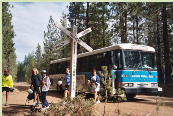
Passengers on the BLM/Lassen Rural Bus shuttle service.

Stan Bales, Outdoor Recreation Planner for Eagle Lake, noted visitor demand for a low-cost weekend shuttle and initiated a partnership between the BLM and Lassen Rural Bus to provide such a service. One weekend day per month, BLM provides a utility trailer with the capacity to carry up to 20 bicycles, and visitors ride the Lassen bus for a small fee. The service attracts between 100 and 200 riders per year,