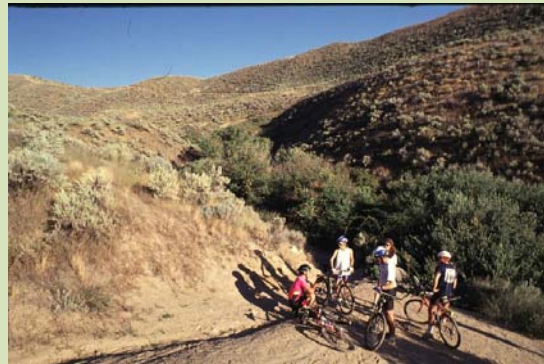
Cyclists enjoying the River to Ridge trail system in Boise.

sidewalks, providing a safe and pleasant route for pedestrians to access trails. Boise residents are supportive of their trail system and nonmotorized infrastructure; they passed a municipal bond to maintain open space and protect trail access.