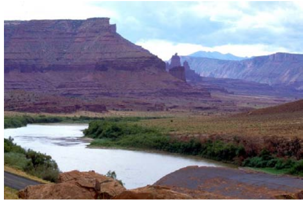
Fisher Towers along Highway 128 near Moab, Utah.