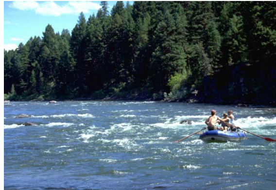
Rafting on the Blackfoot River in Montana.

Agency leadership should focus planning efforts and resources on sites identified in this Inventory Report, or identified by other means, as having high long-term ATS potential. In the near-term, agency leadership at the state and national level can help field office staff pursue actions to enable the future implementation of ATS: form partnerships, participate in regional planning efforts, track visitation, fund and complete planning studies, and identify resources for capital and operation costs. ATS can and should also be integrated into long-term plans for the site, field office, or state to allocate resources and staff accordingly. Finally, at these and other sites, transportation planning efforts should be prioritized