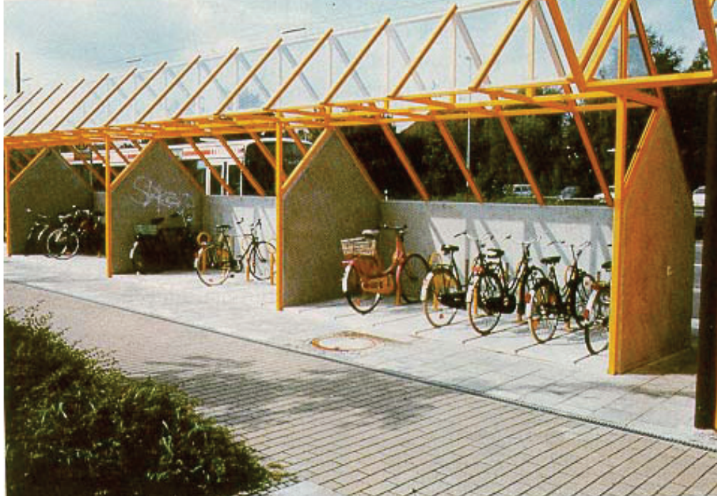
Figure 23-15. Photo. Example of bicycle shelters located at a transit station in Germany.