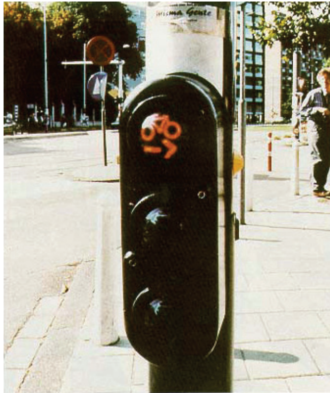
Figure 23-12. Photo. Bicycle signal used in Amsterdam, The Netherlands.

Renting a one- or three-speed bicycle in The Netherlands is relatively inexpensive, costing approximately the equivalent of $6 U.S. per day or about $30 U.S. per week. Bicycle rental shops are located throughout towns and cities, commonly at train stations. Information on bicycle rentals is provided at local hotels.