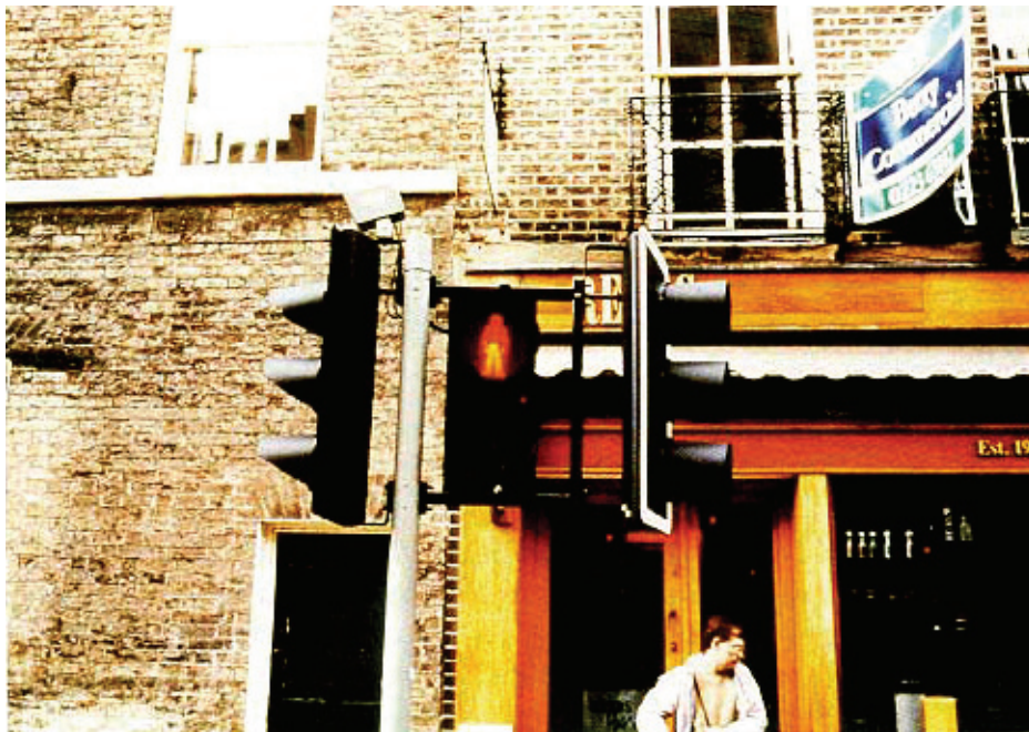
Figure 23-4. Photo. Pedestrian signal with red standing man (shown) and green walking man.