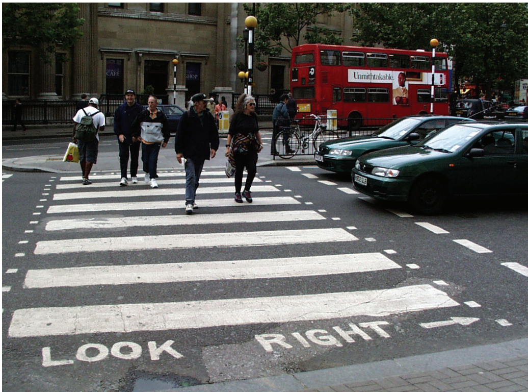
Figure 23-6. Photo. Pedestrian messages on pavement in London, U.K.

Pedestrian messages, such as “LOOK RIGHT” or “LOOK LEFT” (see figure 23-6), are painted on the street next to the curb to remind pedestrians which direction to look for motor vehicle traffic prior to stepping into the street. These messages are used extensively in London, U.K., where many tourists are accustomed to looking left for traffic before stepping off the curb and looking right for traffic when standing at a pedestrian island in the middle of a two-way street. These pavement messages have also been tested in the United States at places like Salt Lake City, UT where the 2002 Winter Olympics were held.