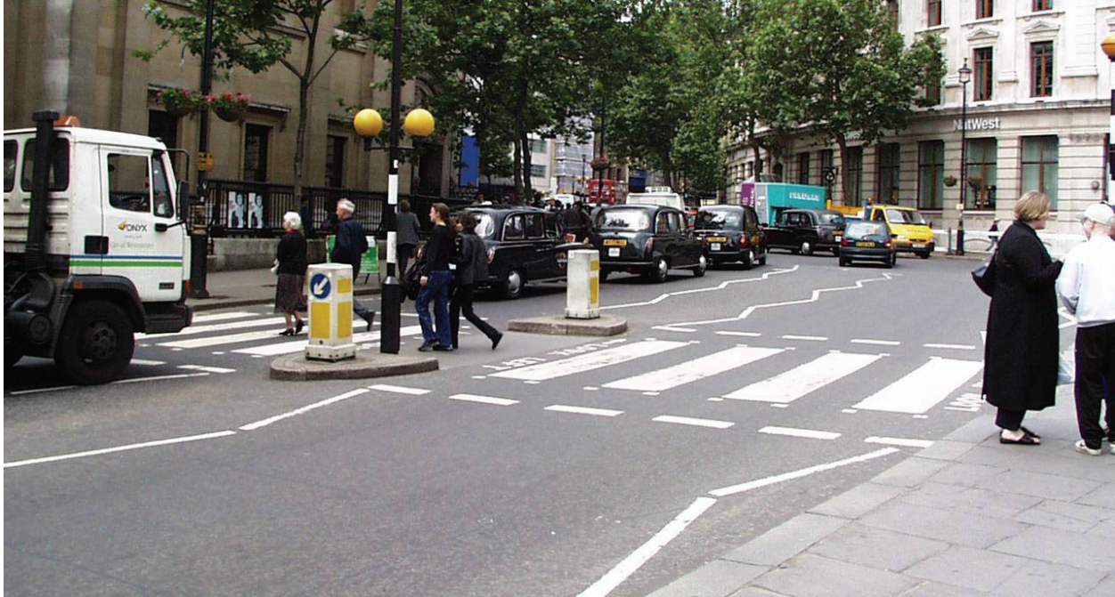
Figure 23-2. Photo. Zebra crossing in London, U.K., with zigzag approach markings and Belisha beacons.

approach. However, zebra crossings are considered inappropriate on high-volume or high-speed roads where the 85th-percentile speed is greater than 55 kilometers per hour (km/h) (35 miles per hour (mi/h)). (5) Pelican crossings (see later discussion), which use a pedestrian-activated traffic signal to assign right-of-way, are often used at these high-volume or high-speed locations where zebra crossings are inappropriate.