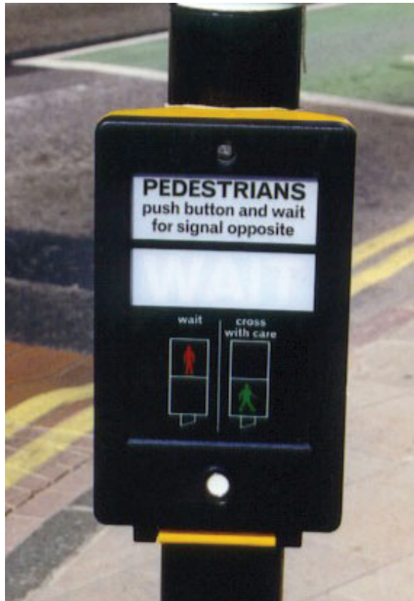
Figure 23-3. Photo. Pedestrian pushbutton for pelican signals in the United Kingdom.