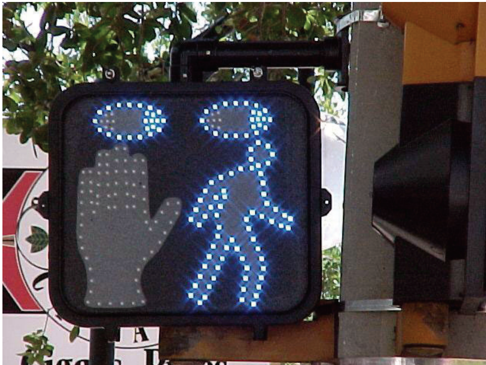
Figure 23-7. Photo. Animated eyes display used in conjunction with pedestrian signal.