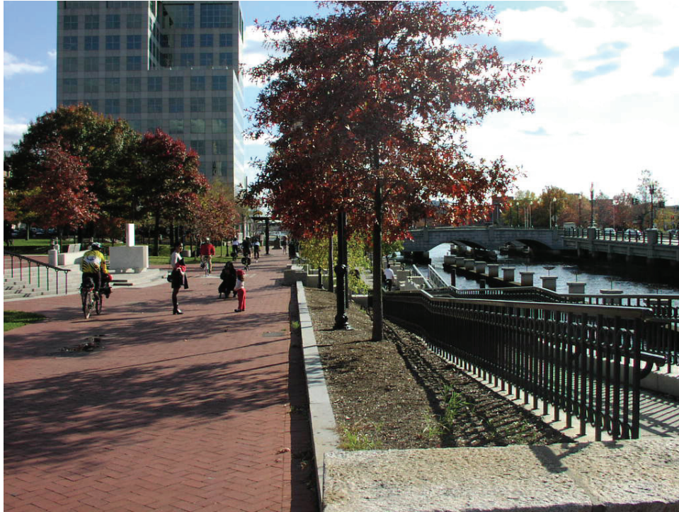
Figure 19-3. Photo. Shared-use paths can be integrated into urban waterfronts and parks, providing direct access to central business districts (East Bay Bicycle Path, Providence, RI).

A wide variety of other facilities are often referred to by the terms path, pathway, or trail. They may share similarities with shared-use paths, but they are not addressed in this course. These include nature and interpretive trails, primitive and backcountry hiking trails, historic trails, heritage trails and touring routes, and walking paths.