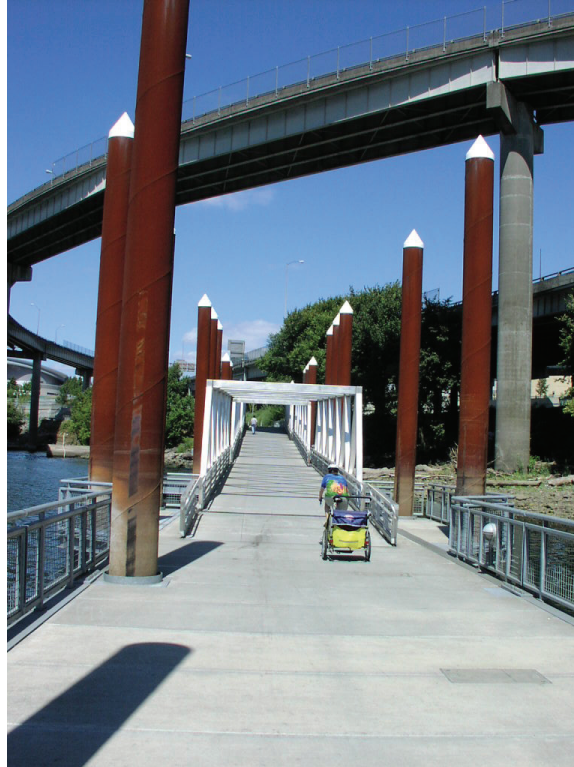
Figure 19-8. Photo. Bridges and floating sections allow paths to cross water and maintain continuity (Eastside Esplanade, Portland, OR).