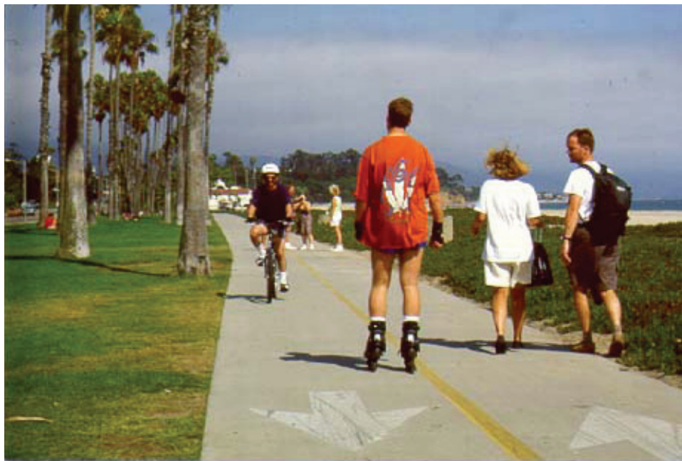
Figure 19-1. Photo. To minimize user conflicts, adequate trail width is critical on paths having high volumes and diverse user mixes (Santa Barbara, CA).

Shared-use paths are typically used by a diverse set of users representing different travel modes, using different types of equipment and traveling at different speeds (see figure 19-1). It is important to understand, even within the basic user categories of bicyclists, pedestrians, and skaters, how diverse path users can be. A recent study, Characteristics of Emerging Road and Trail Users and Their Safety , begins to document the various characteristics of these users and their equipment. (2)