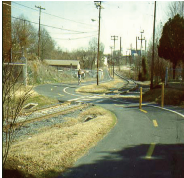
Figure 19-2. Photo. Shared-use paths can be adjacent to railroad lines (Libba Cotton Trail, Carrboro, NC).