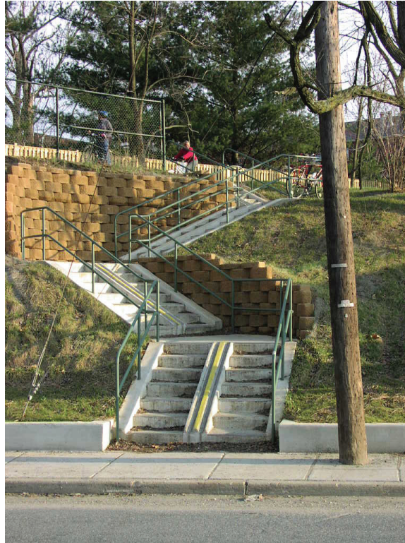
Figure 19-6. Photo. Stairway with bicycle rolling troughs (Capital Crescent Trail, Bethesda, MD).