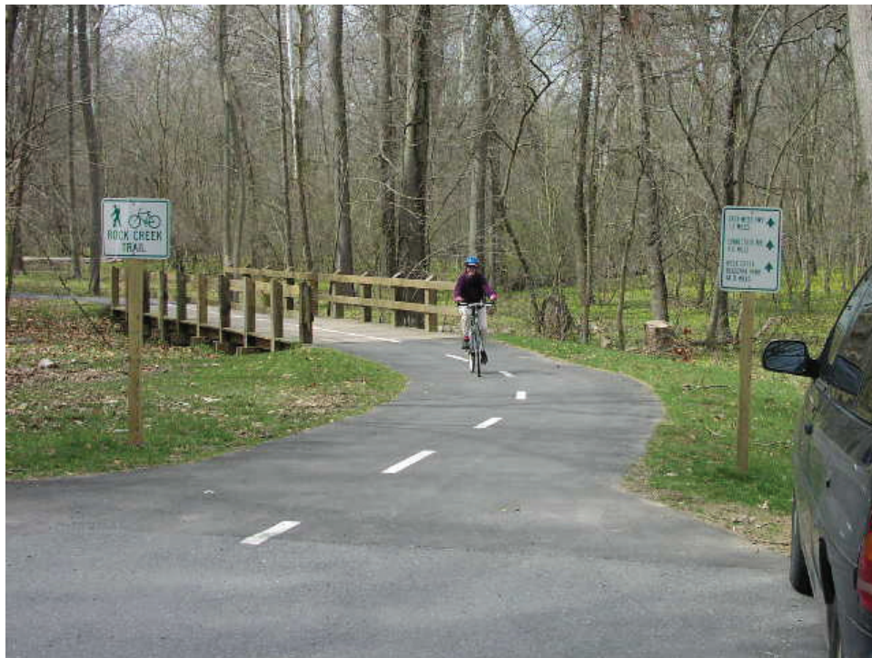
Figure 19-7. Photo. Trailheads with parking and wayfinding signs assist shared-use path users (Rock Creek Trail, Montgomery County, MD).