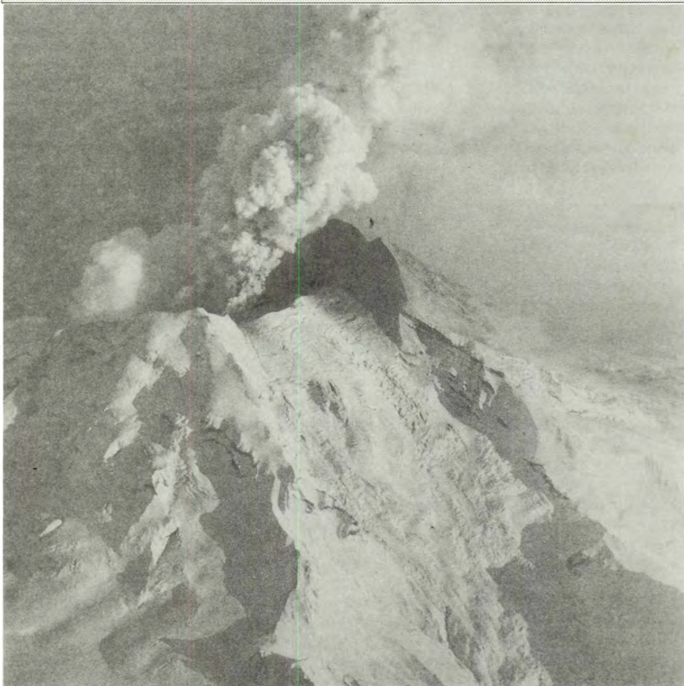
Mount Redoubt -- story on page 2

Office of Public Affairs Alaskan Region 222 West 7th Avenue, #14 Anchorage, Alaska 99513 (907) 271-5296