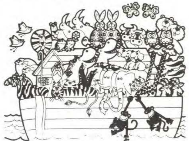
IS THIS THE WAY TO THE KENAI AFSS?

The happy ending to this story is that no one has been harmed, and so far most of our furry friends have only come by to visit and have a quick bite to eat. One thing to remember is that these are all wild animals and should be treated as such. A good closeup picture of Brother Bear or Mother Moose is certainly not worth a life or limb. It's much safer to go down to your local photo shop and buy a good picture to keep in that photo album or to send to mom or dad