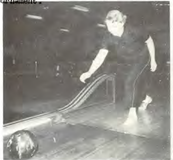
Stock Control Chief Demonstrates Strike Control Technique