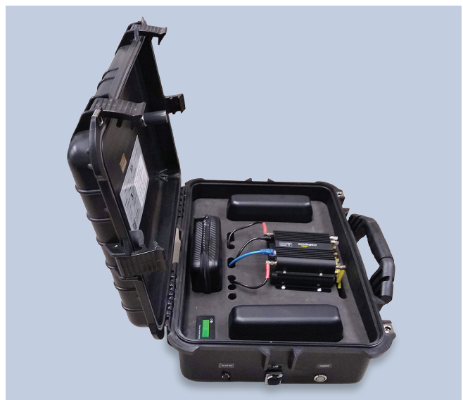
Cellular signal booster

The primary task of the Iowa DOT proposal was to purchase cellular signal boosters and supply them to those in need. These devices enhance signal strength and data transfer speeds.