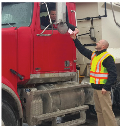
Collection of a paper ticket from a haul truck operator