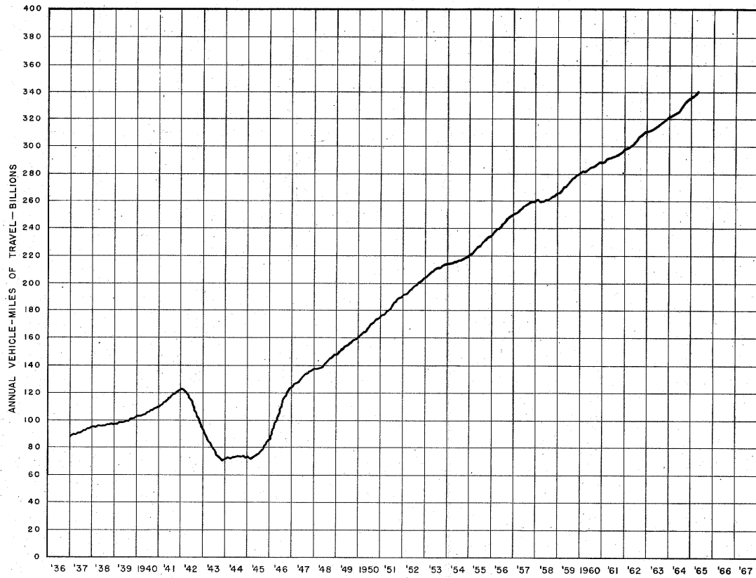
FIGURE 2--TRAVEL ON MAIN RURAL ROADS BY 12-MONTH PERIODS ENDING EACH MONTH, IN VEHICLE-MILES