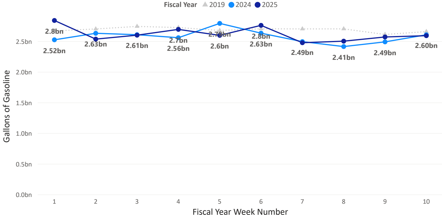
Weekly Gasoline Product Supplied

Gasoline product supplied compared to the same week in FY 2024 decreased by 0.55% and decreased by 2.5% for the same week in FY 2019.