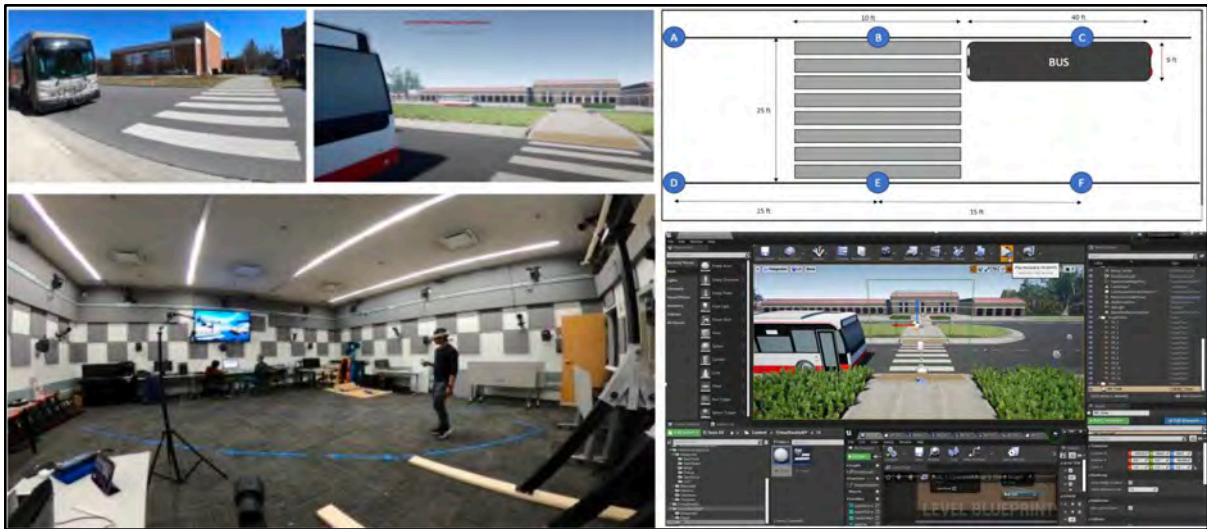
Figure 2. 1:1 multimodal immersive pedestrian crosswalk testbed [11].

Three forms of audio were presented to pedestrians during crossings: (1) distracting music, (2) latent alert signal; and (3) masking interference. First, the distracting music was a popular pop song presented with or without lyrics at a high or low listening level through AC and BC PLDs. Apple Air Pods Pro 1 st Generation, used without noise cancellation, and Aftershokz served as the PLDs for AC and BC; respectively. Next, a latent alert signal, an ambulance alarm, was introduced, with a random delay, in the background once from the right and once from the left side of the pedestrian for each factor combination. Lastly, the masking interference was a digital recreation of an idling diesel engine from a university bus presented in 360° immersive audio within the testbed environment. Using a calibrated sound level meter (~1 m), the idling engine was recorded to be 85 dBA from the rear end of a parked university bus; during experimental trials, masking was presented at 80 dBA to minimize noise exposure.