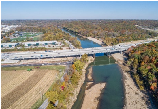
Figure 1: A bridge over the river.

Culverts: All but three of the 35 concrete culverts analyzed in this study used allowable stress design (ASD). By comparing LFR and LRFR for the H20L and MO3S2 vehicles, the study concluded that LFR has higher rating factors and rating loads than LRFR. There were two culverts in commercial zones subject to CZSU and CZRT, making it difficult to develop conclusions about rating trends. Despite the lack of data, the available points parallel a trend. As was the case with H20L and MO3S2, the load rating results for LRFR were about 65%-70% compared to rating loads in LFR.