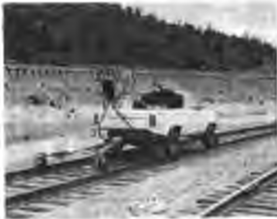
FIGURE 2. HI-RAIL TYPE VEHICLE.

All lubrication systems discussed to this point require lubrication to be applied, then transferred and/or transported to the desired location on the rail as additional steps in the lubrication process. These extra processes can be eliminated by placing lubricant directly on the gage face of the rail with a hi-rail lubricator. The term hi-rail, as it is used here, is somewhat nebulous because most units of this type are basically automotive vehicles that have been adapted for on-track use (see Figure 2). However, the same lubricator system used on a typical hi-rail vehicle has been installed on a locomotive and could be used on a track car.