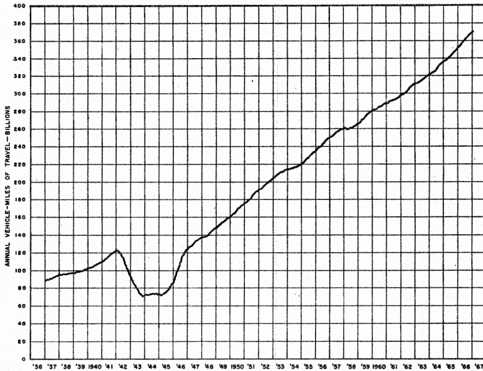
FIGURE 2--TRAVEL ON MAIN RURAL ROADS BY 12-MONTH PERIODS ENDING EACH MONTH, IN VEHICLE-MILES