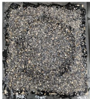
Figure 2: Slab with Epoxy and asphalt-based binder after 140K polishing cycles, Three-Wheel Polishing Device.