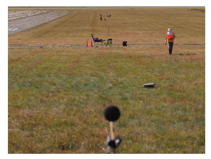
Microphones form a linear array for dynamic flight operation tests at Fitchburg Municipal Airport (MA).