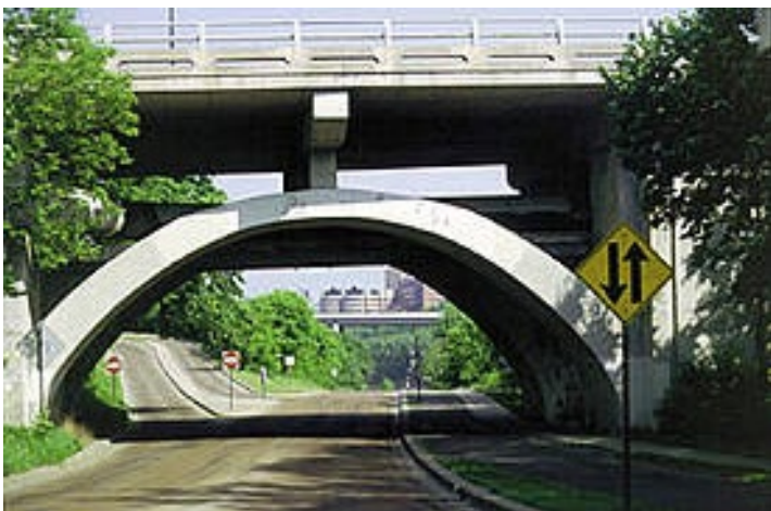
The Grand Rounds Parkway in Minneapolis, Minn., was constructed as part of the city's park system.

Until the early 1950s, engineers typically understood how to incorporate the highway into the landscape because they had worked on multidisciplinary teams with landscape architects or had training in sympathetic layout and construction. However, the 1944 Defense Highways Act initiated the decline of collaborative highway design in favor of urgent, rapid construction of military highways, which provided mass employment and met national security needs.